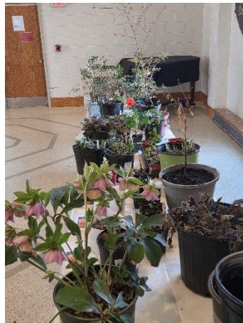
Plants available to attendees in our plant exchange