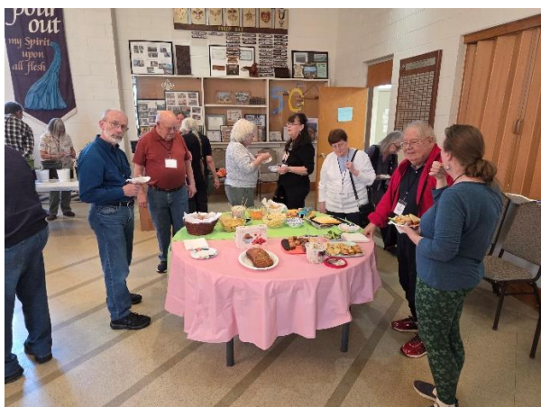
Members enjoy delicious refreshments