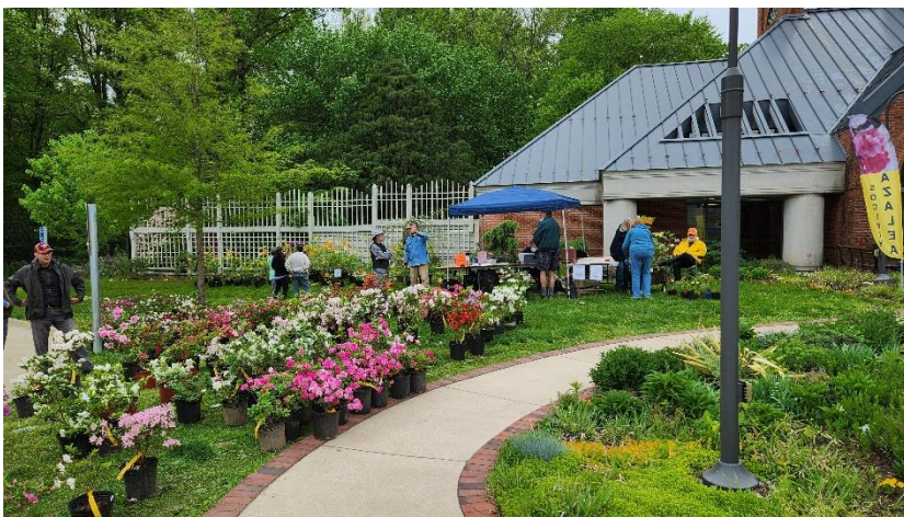
Chapter plant sale at Meadowlark in 2024

The chapter will be holding its spring plant sale at Meadowlark Botanical Gardens on 25 April from 9am to 3pm. This is our major fundraiser for the year and has been well received by the general public in the past. Hopefully this year is no different.