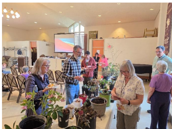
Once again, we had a great selection of plants in the exchange