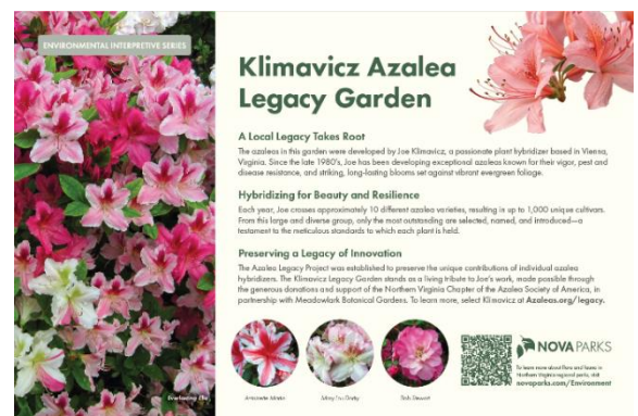
Mockup of Proposed Signage