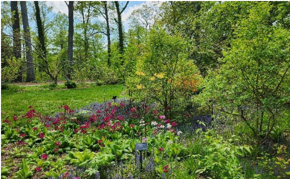
London Town Gardens