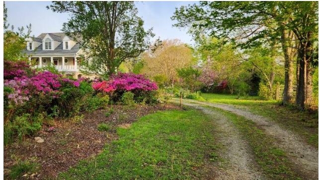
Entry lane with Formosa azaleas, hydrangea, and other varieties