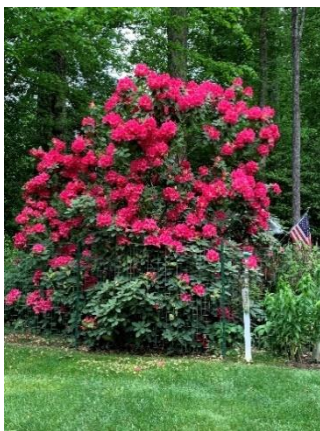
Rhododendron "Big Red"