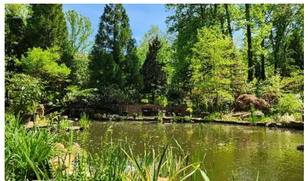
Hidden View Farm (Bradshaw) Garden