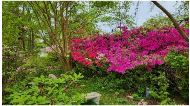
Serenity Garden with Formosa and Kings Luminescence Pink Azaleas