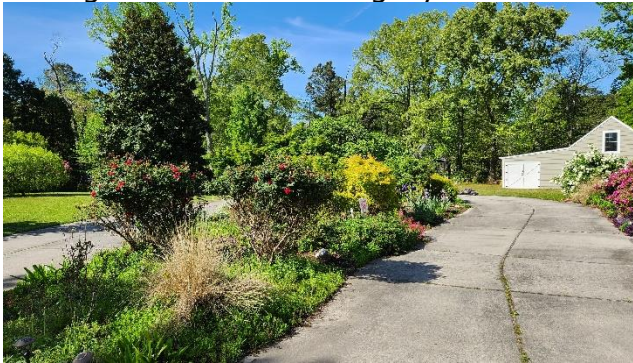
Eclectic collection of plants including deciduous azaleas.