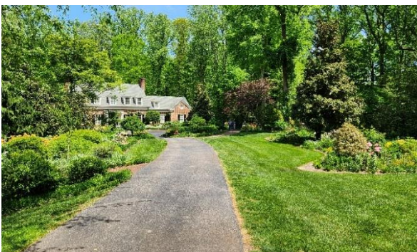
Hidden View Farm (Bradshaw) Garden