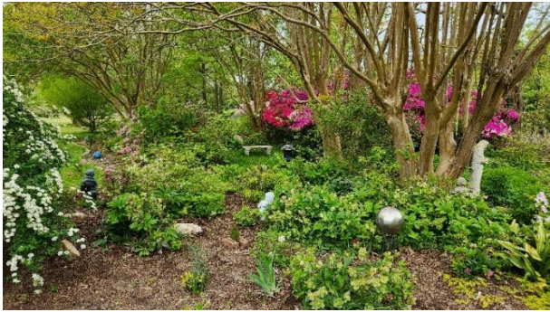
Looking towards the Serenity Garden through the Klimavicz Legacy Garden