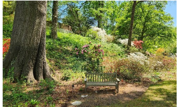
London Town Gardens