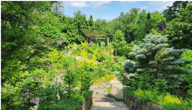
Tennis Court Garden