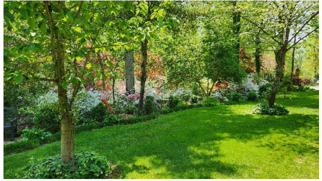
Hidden View Farm (Bradshaw) Garden