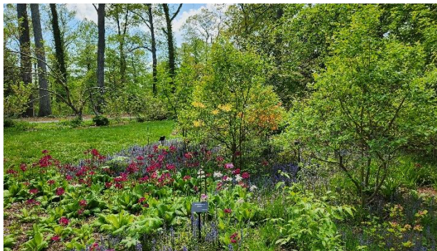
London Town Gardens