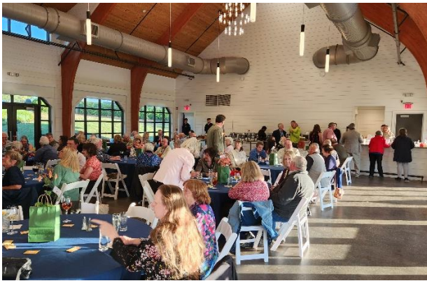
Banquet at the Ag Heritage Pavilion