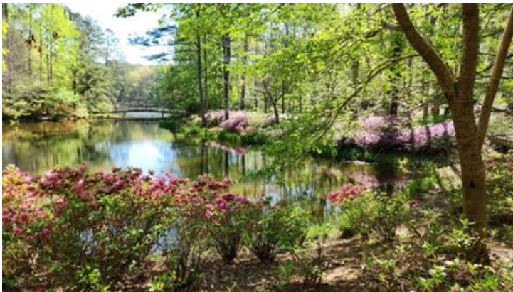
Lake at the Azalea Bowl at Callaway