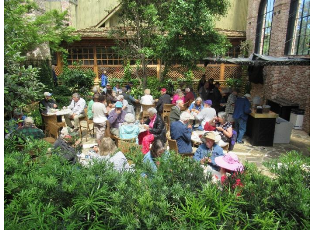
Lunch at Botanic