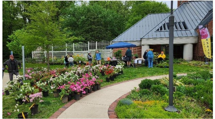
April 27th Chapter Plant Sale at Meadowlark Botanical Garden

We had a great turnout of members to help with the sale. Despite the bad weather and ending the sale two hours before originally scheduled, we had great results. The chapter sold 109 plants with a gross receipt of $2,057. Thanks to all the chapter members who assisted with the sale on April 27 th .