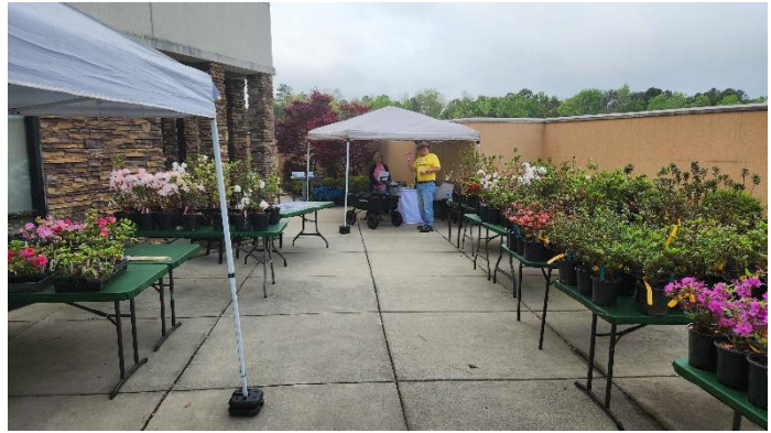
Plant sale setup.

The first day of the convention an "Azaleas 101" seminar was conducted at the College of Forestry on the Auburn University campus. These seminars are becoming a standard part of conventions and introduce attendees to the society and to azaleas. The day also consisted of registration, the society board meeting, a plant sale, and the welcome reception.