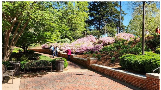
Memory Garden across from Davis Arboretum

The second day consisted of garden tours. We first toured the Davis Arboretum, a 13.5-acre arboretum at Auburn University. The azaleas, including a large number of deciduous varieties, were in full bloom. This was followed by lunch at the Botanic restaurant/nursery in neighboring Opelika, AL. We had a delicious box lunch in their open-air courtyard and then had time to shop in their nursery.