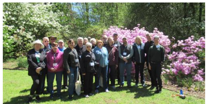
Some of the Northern Virginia Chapter members and associate members in attendance