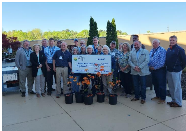
Convention organizers accompanied by members of the Alabama Legislature, ASA Board Members and staff of the Mid-State RCD posing with a mockup of the check from the RCD to Alabamense Chapter