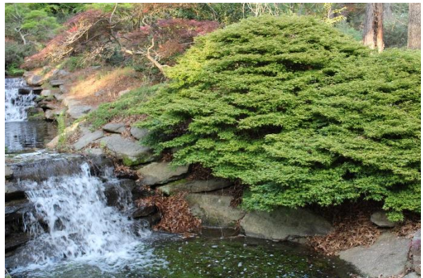
Waterfall at Crooked Oaks Pavilion