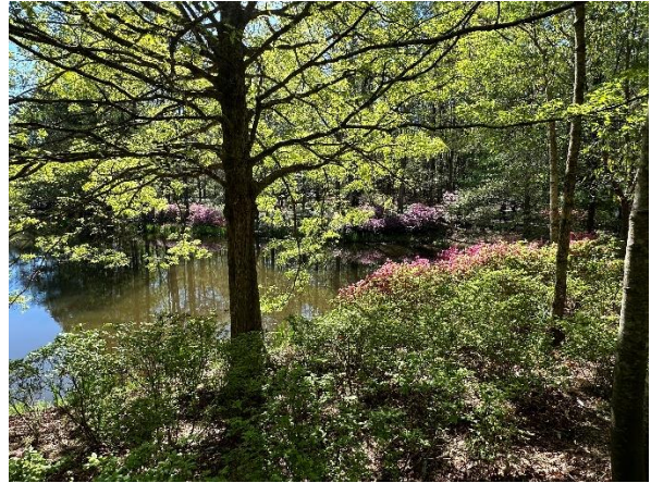
Callaway Azalea Bowl