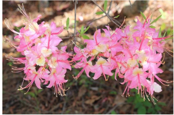
Wedding Cake at Greenleaf Garden