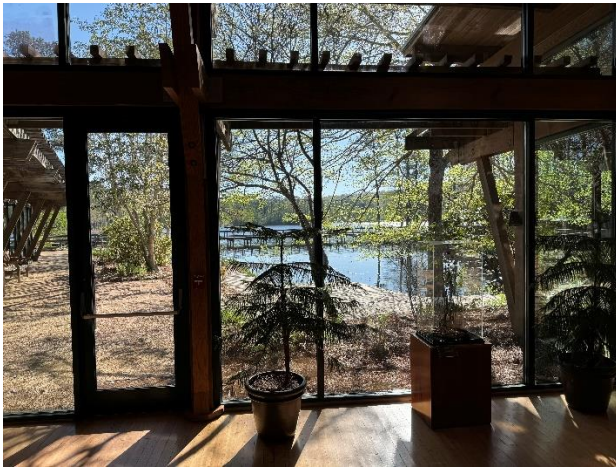
Callaway Discovery Center