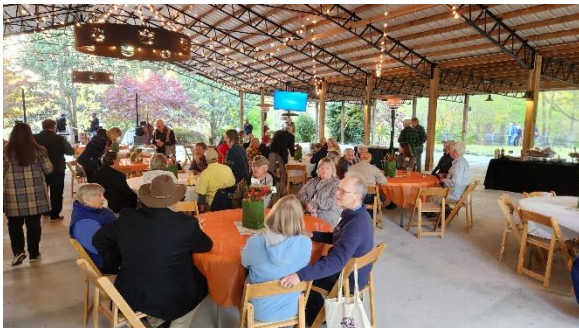
Dinner at Crooked Oaks Pavilion