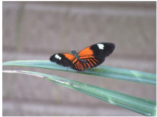
Butterfly at Callaway Butterfly House