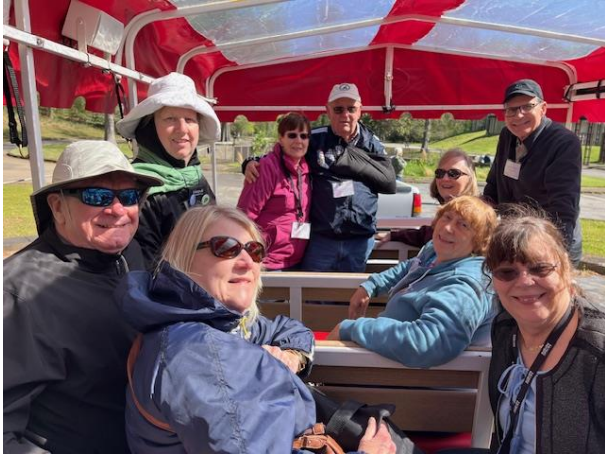
Chapter members on the Tram at Callaway Gardens