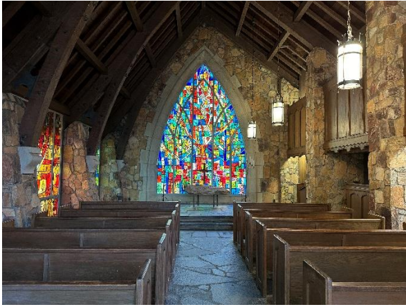
Ida Cason Callaway Memorial Chapel