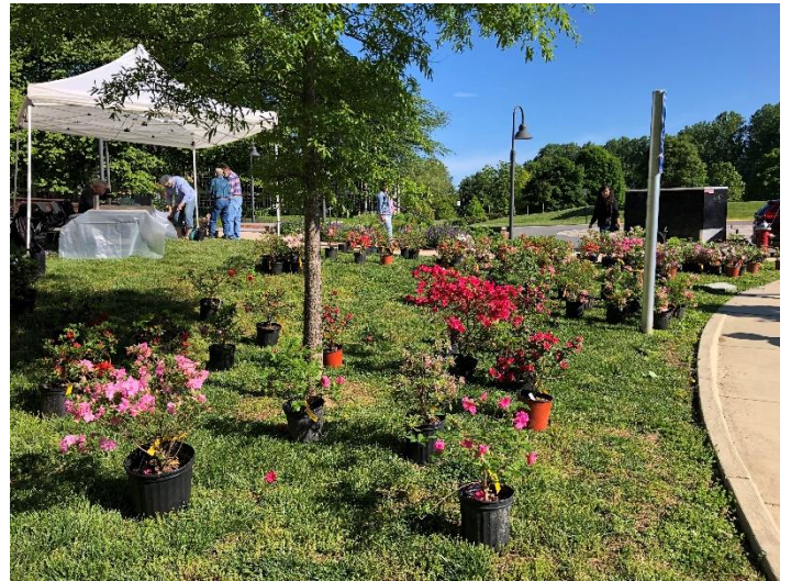
2023 Meadowlark Plant Sale

These sales cannot be accomplished without the assistance of chapter volunteers.