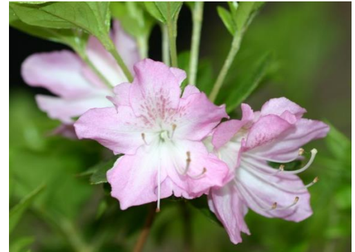
Aioi (Fairy Queen)