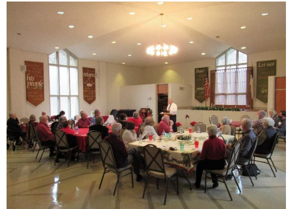
2021 Holiday Social at Kirkwood Presbyterian Church

This will be our annual Holiday Social and Annual Meeting. It's a great opportunity to socialize with other members of the chapter and also to make decisions for the chapter as we go into 2024.