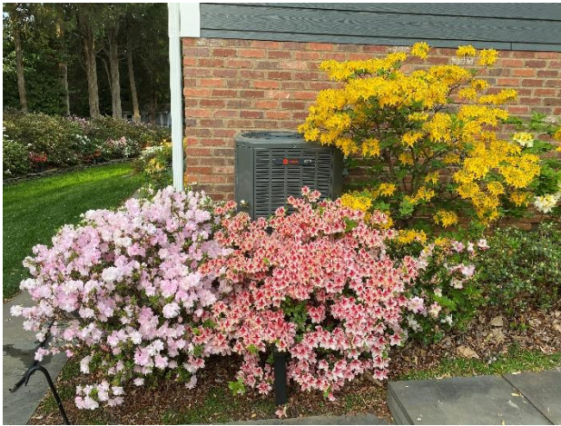
Klimavicz Garden – Vienna, VA