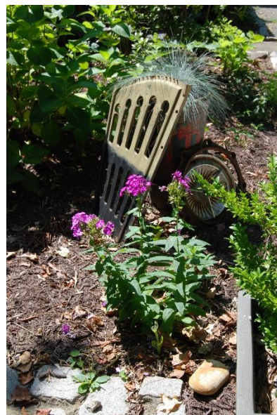
Harrison Garden – Midlothian, VA