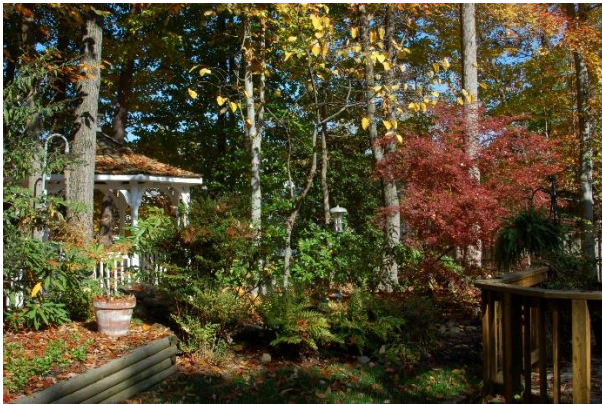
Neckel Garden – Fairfax Station, VA