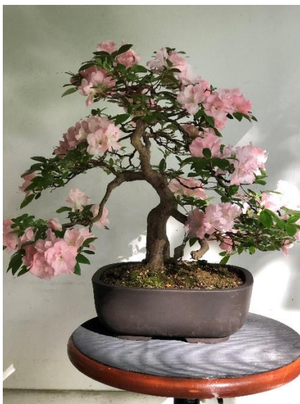
Gutierrez Bonsai Collection – McLean, VA