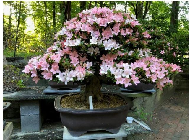
Mitchell Collection – Stafford, VA