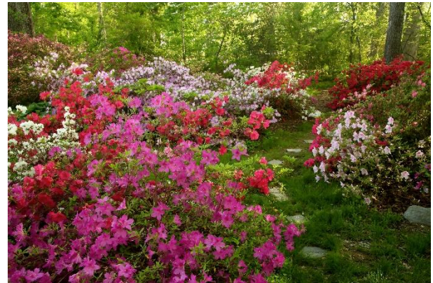
Sperling Garden – Alexandria, VA

We look forward to seeing you. If you are unable to join us in person, the presentations will be broadcast via Zoom. To join via Zoom at 2 pm: