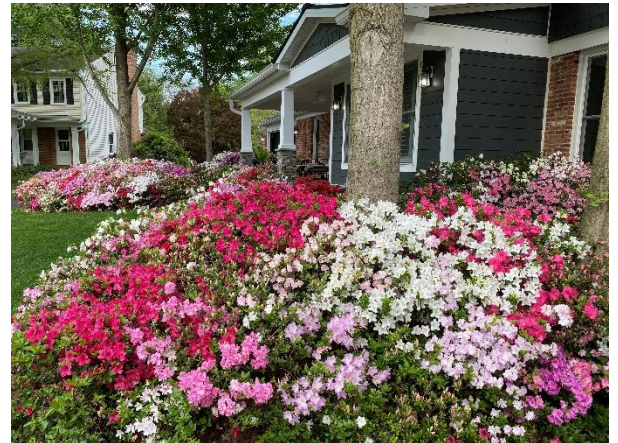
Klimavicz Garden

We will also have a plant exchange, which has become a favorite of many of our members.