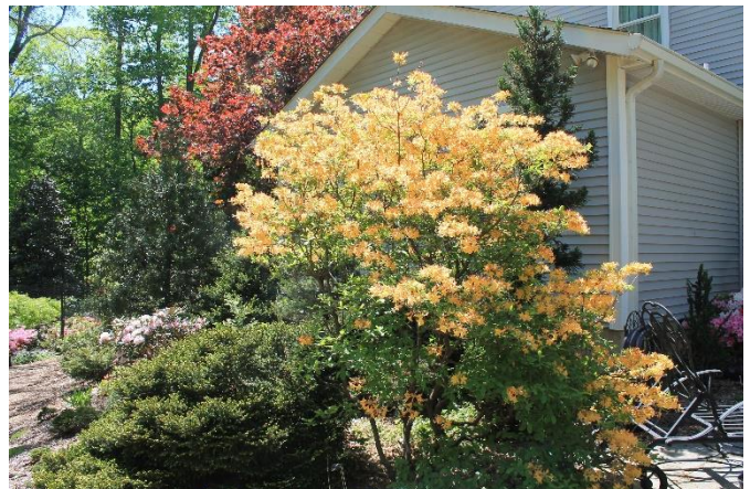
Beck Garden – Oak Hill, VA