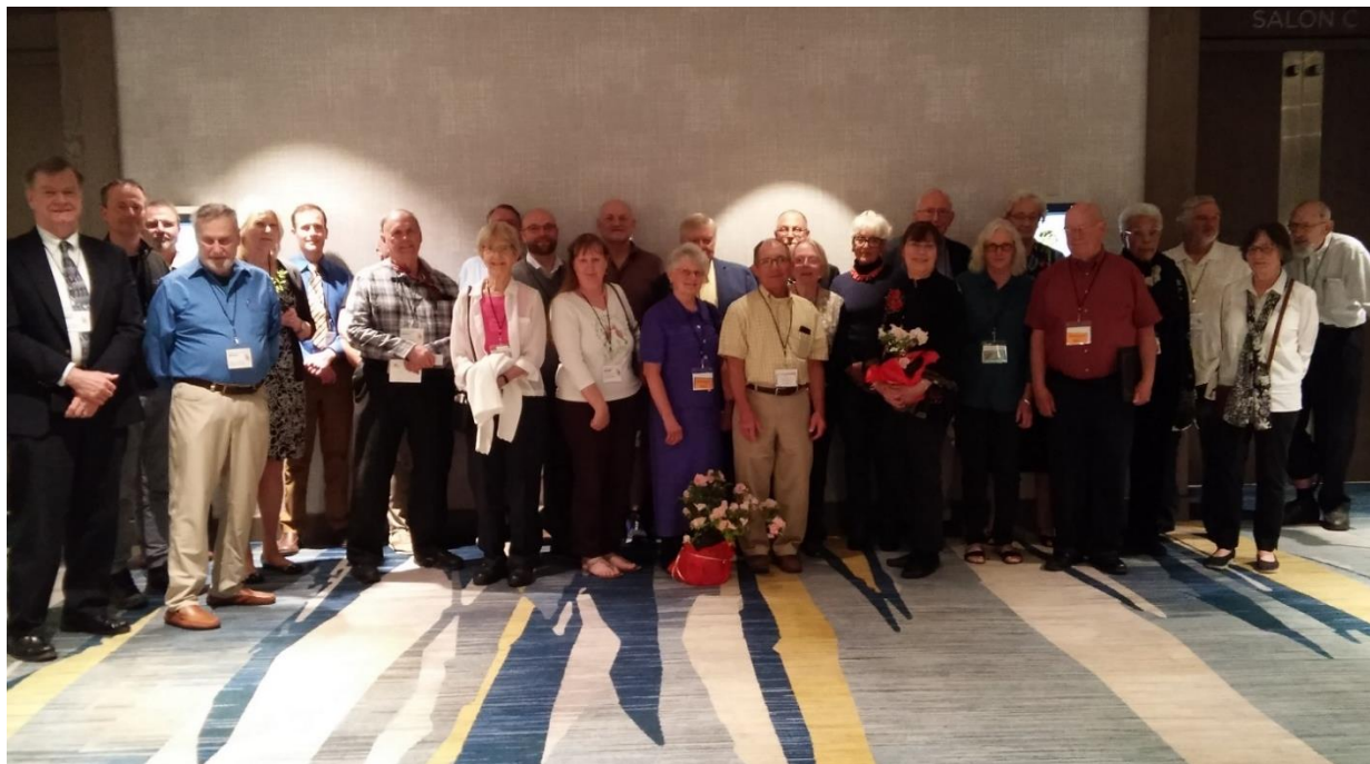
Northern Virginia Chapter members and Associate Members after the ASA banquet