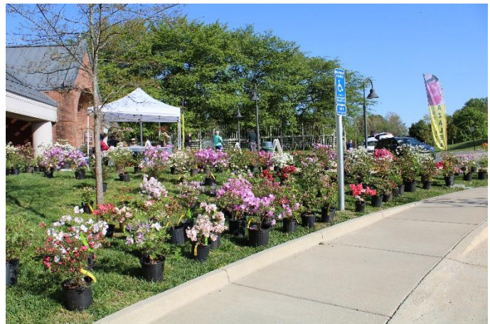
2022 Meadowlark Plant Sale

Chapter plant sales are the primary means of generating funds for the chapter. These funds help us conduct our chapter activities and make charitable contributions to other, mainly horticultural, organizations at the end of the year. Additionally, it allows us contact with the general public to promote azaleas and the chapter/society.