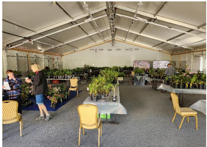
The Plant Sale Pavilion ready for the first customer