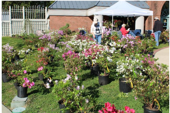
2022 Meadowlark Plant Sale

We have adjusted our plant sale schedule this year, focusing on those venues which provide the best returns on our investment of time and resources. This year we will be holding our major plant sales at Meadowlark Botanical Garden in Vienna, VA. The primary dates are 29 April (rain date 30 April) and 6 May (rain date 7 May).