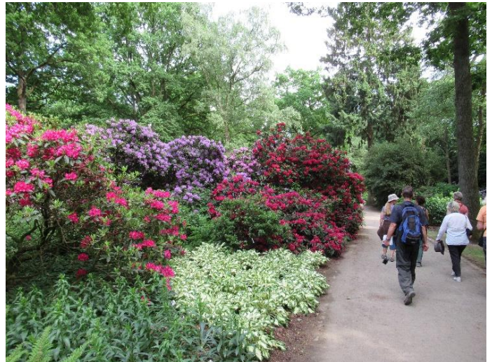
Occidentale in section of North American varieties