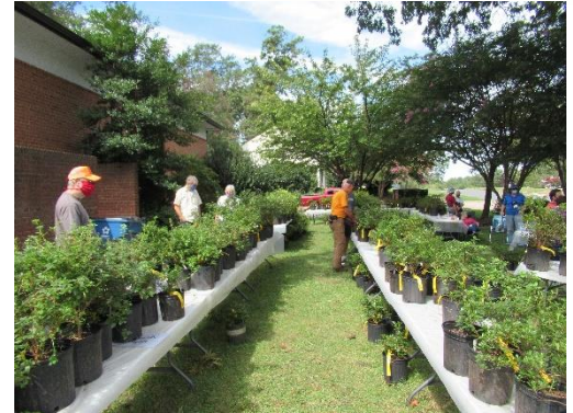
Customers examine plants at the 2021 Fall Azalea Sale

If you are able to assist in setting up, running or breaking down the sale, please contact Barb Kirkwood at (703) 268-6958 or kirkwoodb@aol.com.