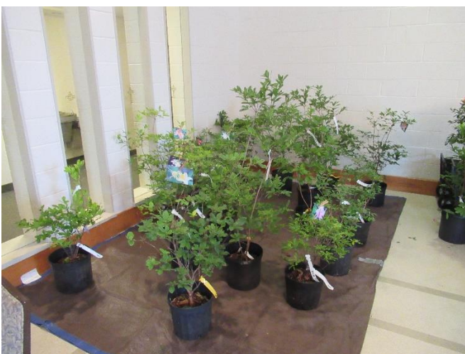
Deciduous azaleas available for sale