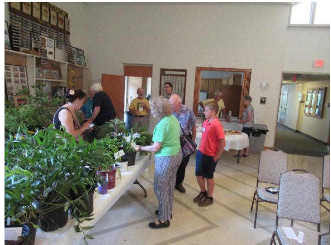
We had a large selection of plants in the exchange