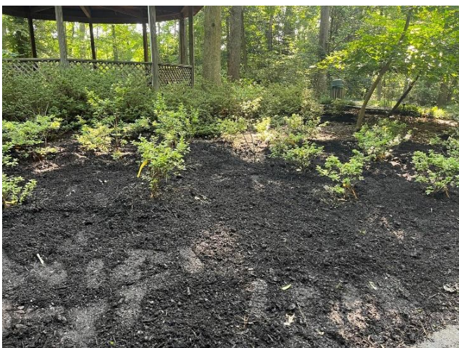
Newly mulched bed of Klimavicz azaleas