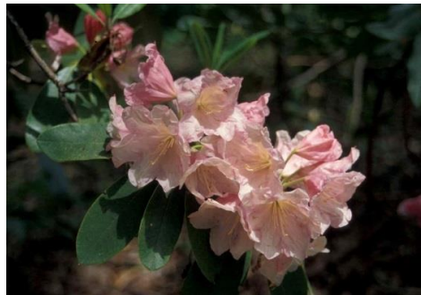
Rhododendron 'Hanna Hersey'

It began with the brilliant red 'Taurus', peach pink 'Hanna Hersey', and pink and cream of 'Martha Phipps'. Several plants of the deep pink 'David Gable' were to the left. They were quickly followed by the rose red 'Atroflo', white 'County of York' and lavender pink 'Caroline'.