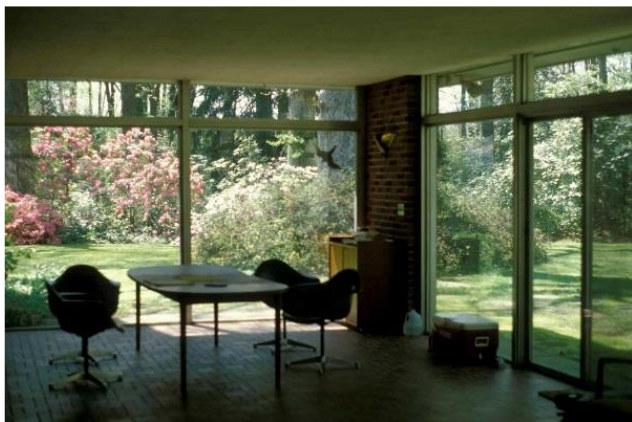
'David Gable' as viewed from the garden room