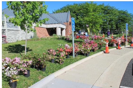
Meadowlark Botanical Gardens Plant Sale

The chapter will be holding its first plant sale of the year at Meadowlark Botanical Gardens in Vienna, VA on 30 April and 1 May from 10am to 3pm. We will also be selling at Ayr Hill on May 7 from 8am – 1pm. Pass this information on to your friends.