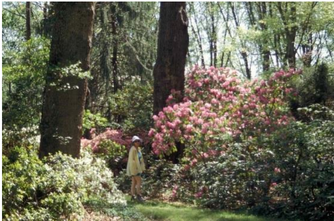
Rhododendron 'David Gable' in the garden

It began with the brilliant red 'Taurus', peach pink 'Hanna Hersey', and pink and cream of 'Martha Phipps'. Several plants of the deep pink 'David Gable' were to the left. They were quickly followed by the rose red 'Atroflo', white 'County of York' and lavender pink 'Caroline'.