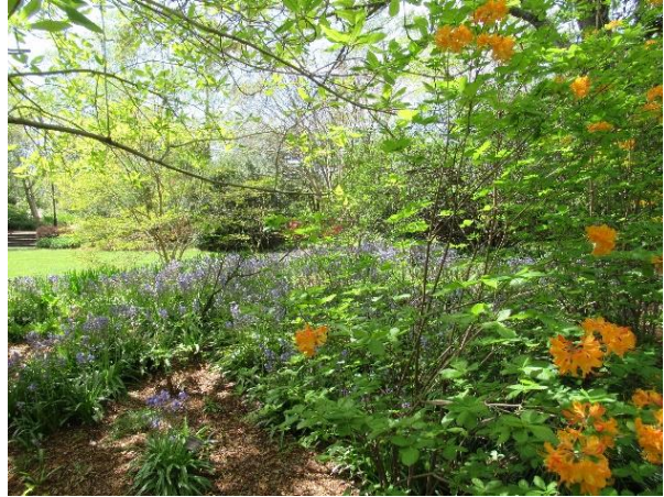
Azalea Floral Displays, Virginia Garden Week, Fredericksburg, VA