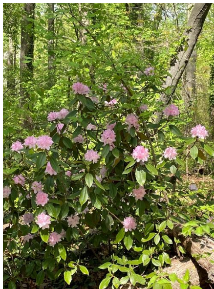
Maymont Garden (Japanese Garden), Richmond, VA