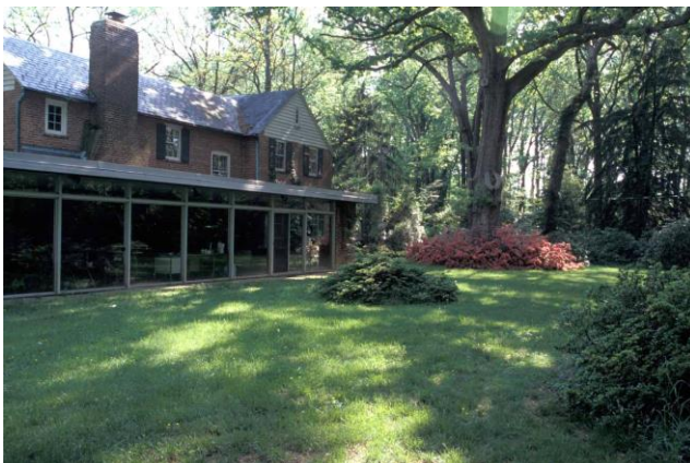
The garden room and centuries old oak

The story was similar with Green Spring Gardens since that land sat idle for 10 years before they started to develop that into a horticultural park. It is a wonderful asset today.