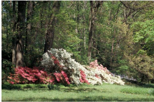
The azalea border as viewed from the garden room

As the season progressed, the perimeter of lawn behind the home was a continuation of rhododendron blooms that seemed like a slow-moving firework display.