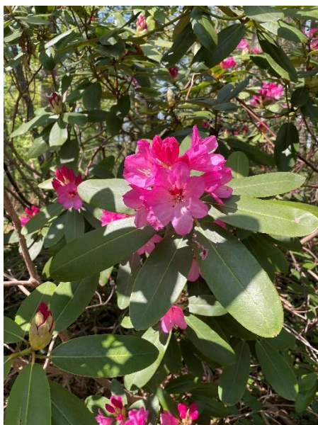
White Garden, Fairfax County, VA

Below are garden photos submitted by members.