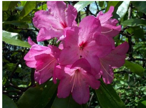
Rhododendron 'David Gable'