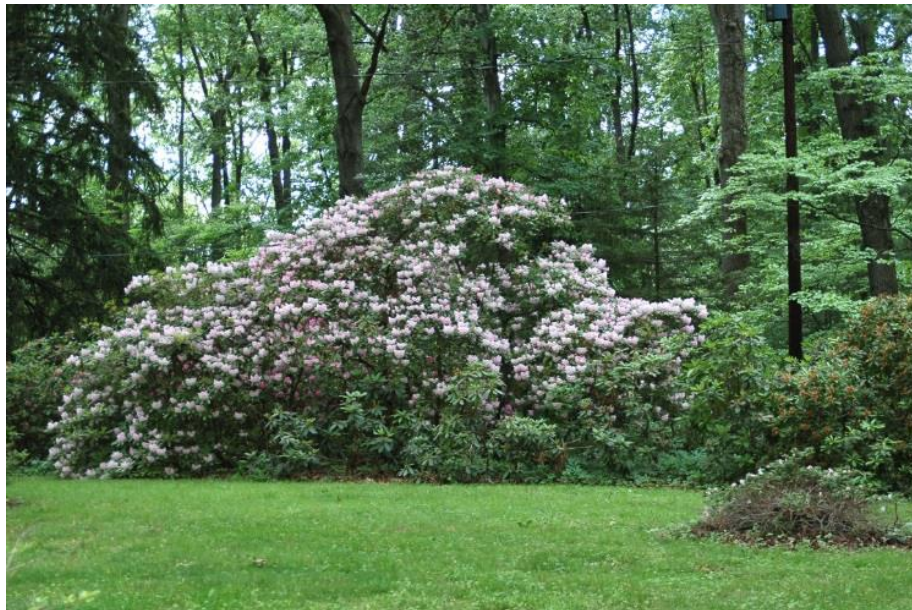
Rhododendron 'Cadis' as viewed from the garden room

surely the most impressive specimen in the Washington, D.C., region. It had the prime location at the edge of lawn behind the home. It was so perfectly framed by the floor to ceiling glass walls in the garden room. Like 'Caroline' one of its parents, it is fragrant, too.