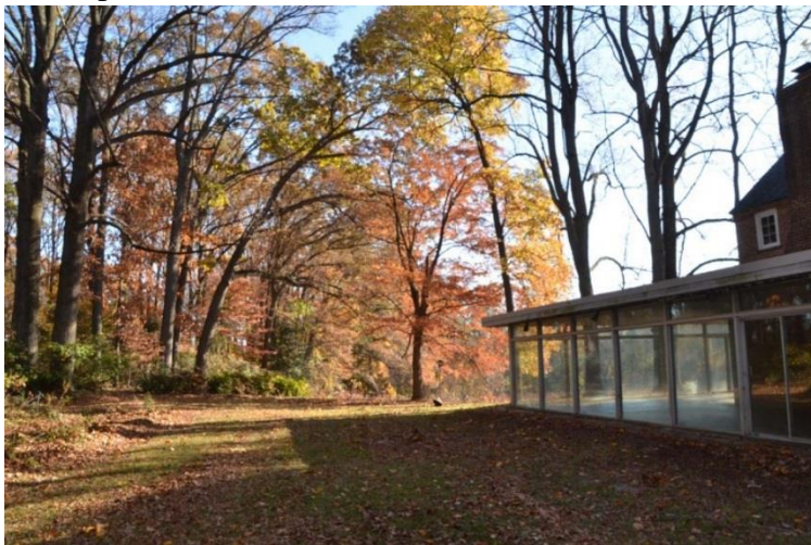
Autumn vista of the garden room, the core of the garden