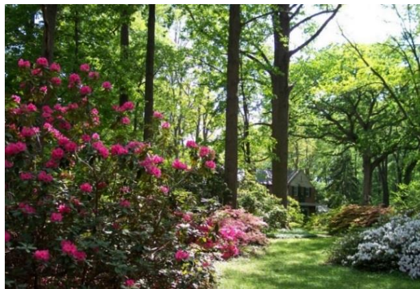
Rhododendron 'Anna Rose Whitney'