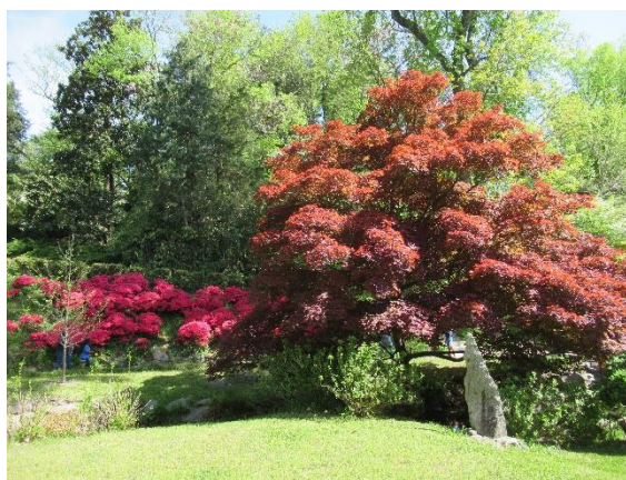
Norfolk Botanical Garden, Norfolk, VA