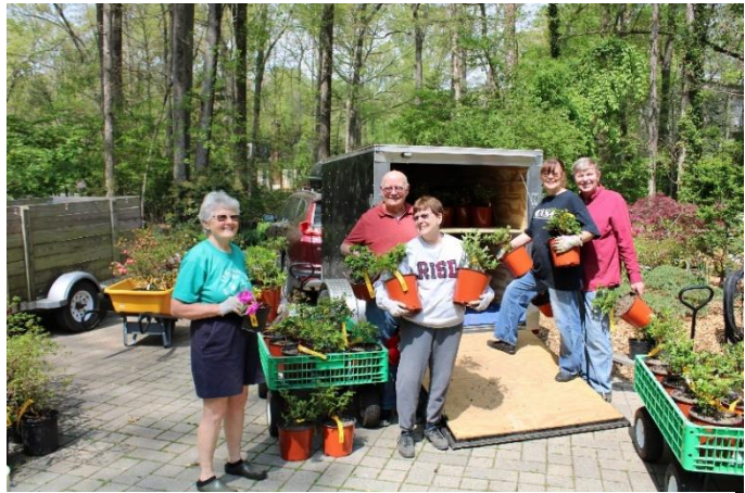
Volunteers unload azaleas for repotting

Thanks to these members for their time and effort in repotting these plants. Additional photos are at the end of this message.