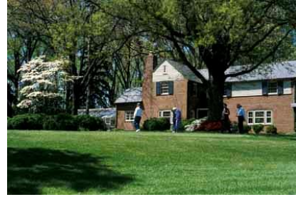
The White Home is not historic

The objective of a Fairfax County Resident Curator program is the preservation of historic buildings within the county...The end goal is to rehabilitate and maintain underutilized historic properties and provide periodic public access to appreciate the historical significance of the properties.