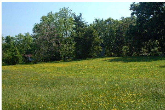
The Meadow - Buttercups