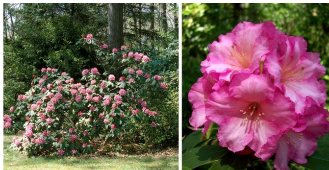
Rhododendron 'John C. White' plant and flower

Oversight and/or staffing by professional horticulturalists and specially trained grounds staff will be required. Managing and maintaining high quality horticultural resources requires staff with specialized education, training, and experience. During peak gardening season, additional volunteer hours per week would enable the staff to maintain quality plant displays. Ideally, the primary horticulturalist would have at least a two-year degree in horticulture plus a few years of experience. Seasonal staff with specialized training would be beneficial.