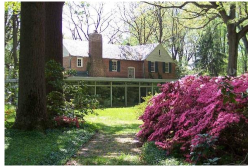
The Home could have multiple uses

The residence on the White site presents many opportunities. Consideration may be given to the conversion of the first floor of the residence to public space. The second floor may be set aside for use as an on-site caretaker's residence. Exterior access to expanded restroom facilities within the residence may be provided.