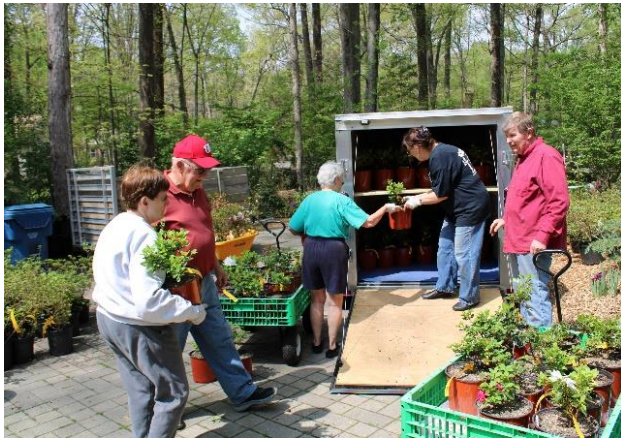
Volunteers offload plants