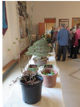
Some of the plants available for exchange (less bonsai)