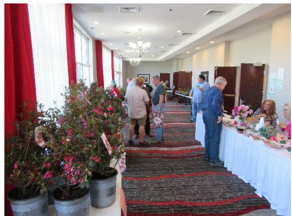
Plants available for the plant sale