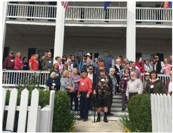
Most of the attendees at Lafayette Museum