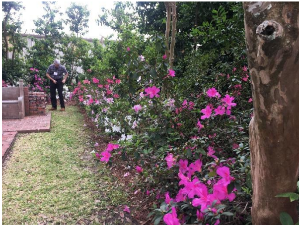
Lafayette Museum Garden