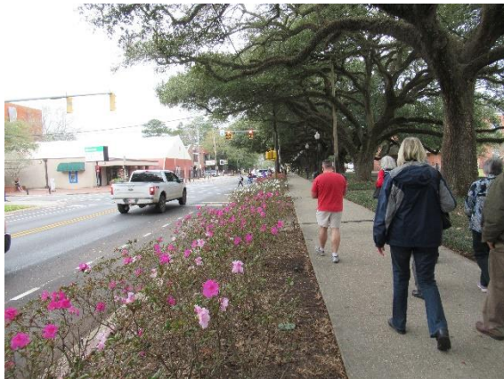
Encore® azaleas planted along a street through the university

treated to excellent Louisiana cuisine and interesting speakers. Some of us also expanded our azalea collections from the on-site plant sale.