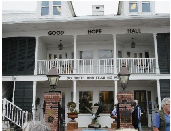
Good Hope Hall