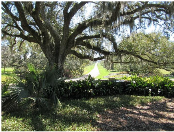
Live oak at Jefferson Island