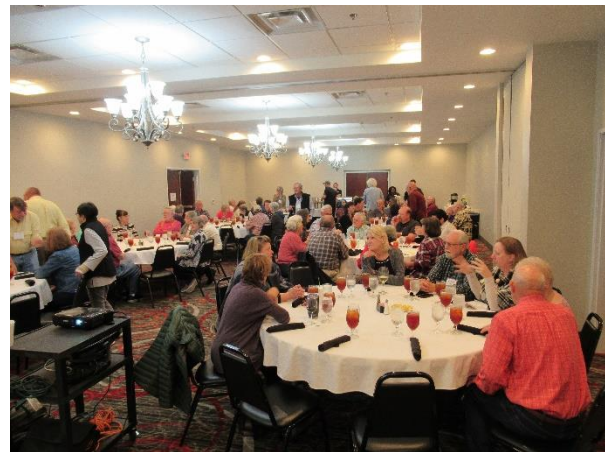
One of the evening dinners