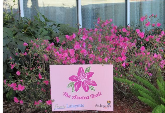
Azalea Trail poster in front of the convention hotel

Our base for the convention was the Holiday Inn North in Lafayette. All activities except for the tours were held in this modern facility. We were