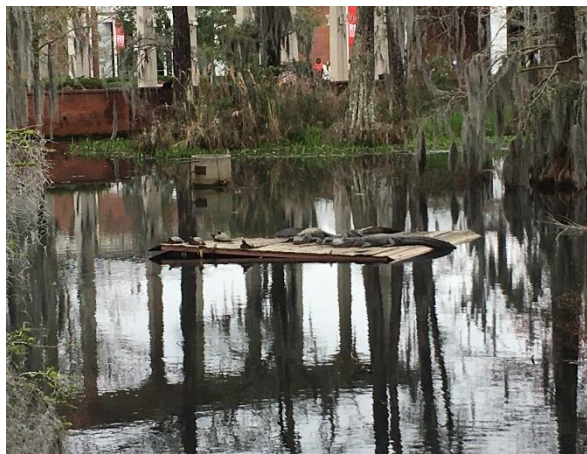
Alligators and turtles in Cajon Lake on the campus of the University of Louisiana, Lafayette