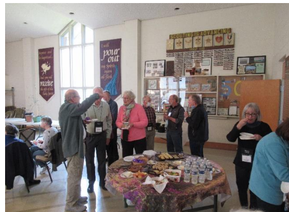
Members socialize before the program