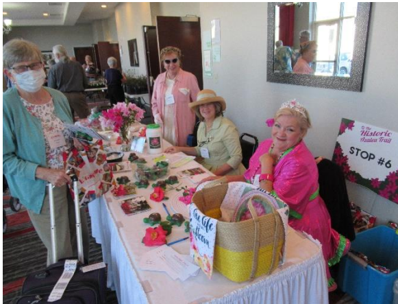
Registration table ladies