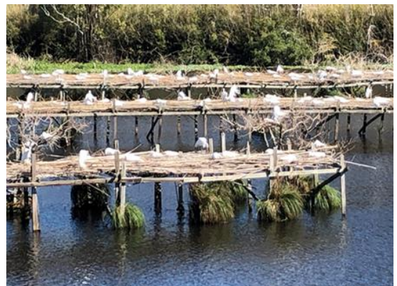
Egret rookery on Avery Island