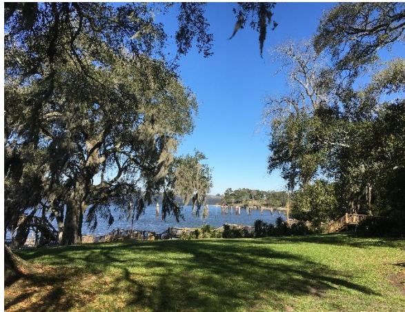
Jefferson Island