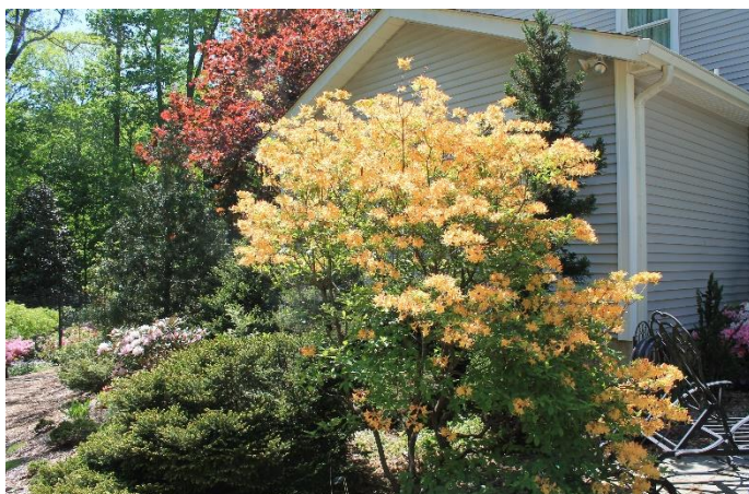
"My Mary" in Beck Garden

Our membership is spread across the country and to Canada and Europe. Obviously, many of our members can't physically tour other members' gardens because of distance. Many of you work very hard to create beautiful gardens and you should show them off.