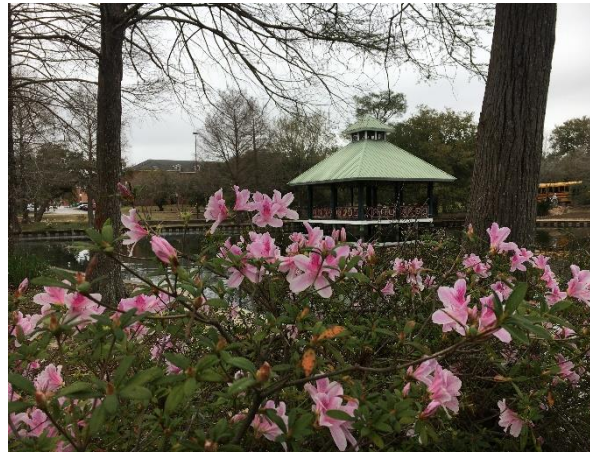
Gazebo at Girard Park