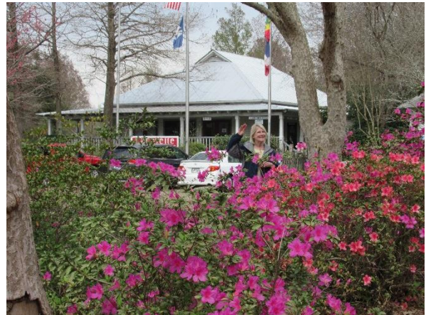
Lafayette Visitor's Center