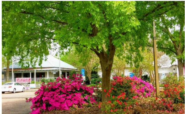
Lafayette Visitor's Center

After having to cancel the last two conventions due to COVID, the society will meet once again this year in Lafayette, LA. The convention committee has done a lot of planning to promote the beautiful venues in and around Lafayette. It should be a wonderful convention and it will be great to see old friends from different parts of the country. More information on the convention and the various venues is in the summer, fall and winter issues of The Azalean . Additional information on the convention is also available through the society website at https://www.azaleas.org/convention-2022/ .