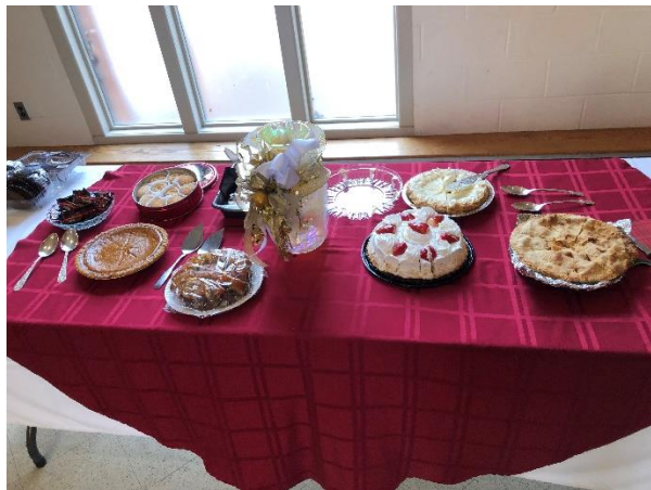
Delicious collection of desserts

Below are some photos from the Holiday Social.