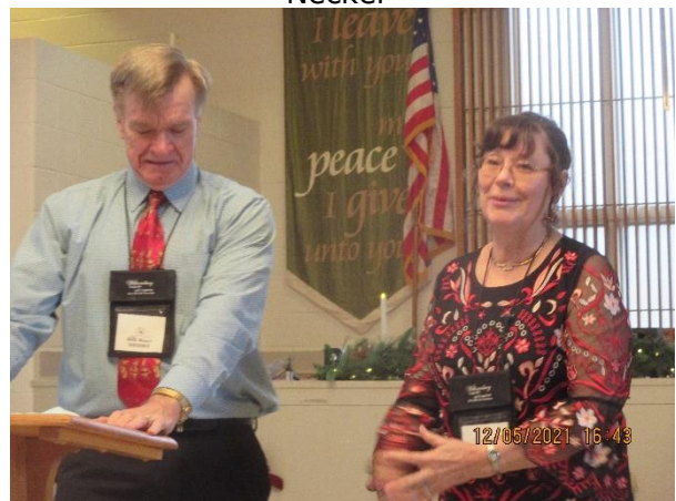
Outgoing and incoming Presidents