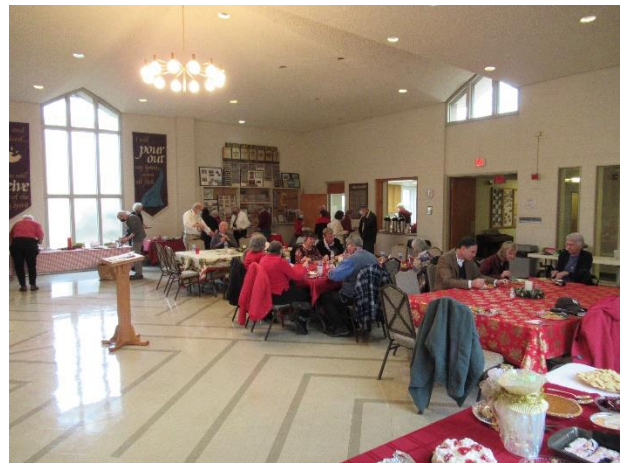
Attendees enjoy a delicious meal with other chapter members