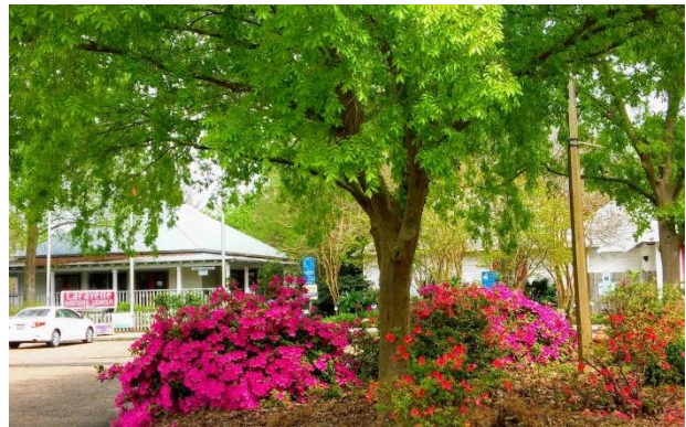
Lafayette Visitor's Center

After having to cancel the last two conventions due to COVID, the society will meet once again this year in Lafayette, LA. The convention committee has done a lot of planning to promote the beautiful venues in and around Lafayette. It should be a wonderful convention and it will be great to see old friends from different parts of the country. More information on the convention and the various venues is in the summer, fall and winter issues of The Azalean . Additional information on the convention is also available through the society website at https://www.azaleas.org/convention-2022/ .