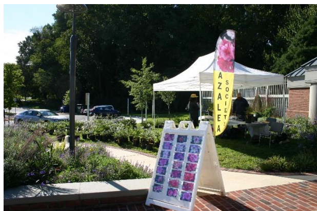
Chapter Plant Sale at Meadowlark Gardens

For the first time, the chapter participated in an azalea sale at Meadowlark Gardens in Vienna, VA. The chapter has been working with the garden for several years in developing a Legacy Garden of Klimavicz azaleas.