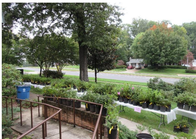
Sale azaleas arrayed by hybrid group