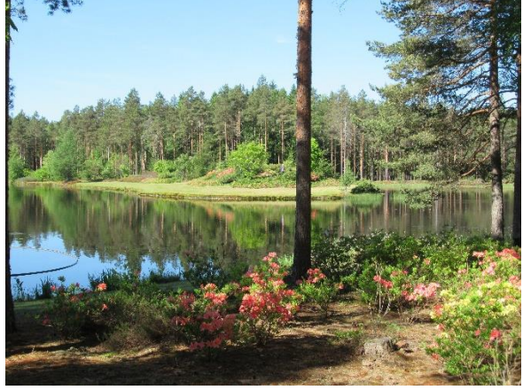
Ilola Arboretum, Salo, Finland