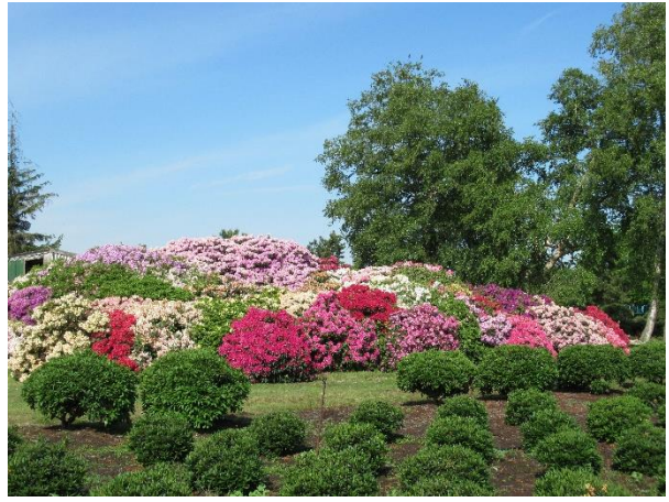
Van den Berk Rhododendron Nursery