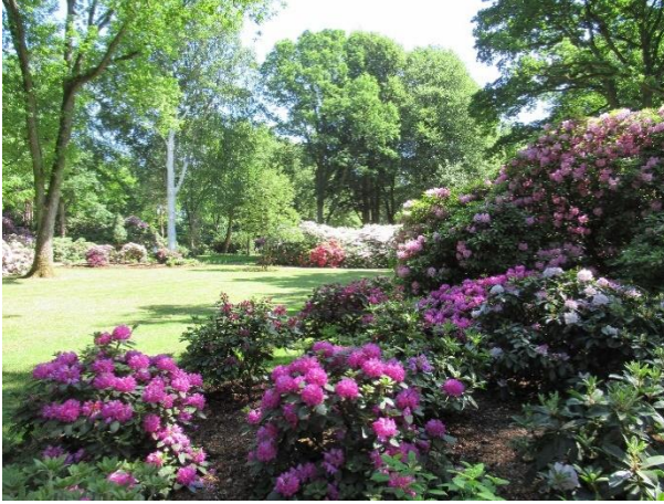
Bremen Rhododendron Garden