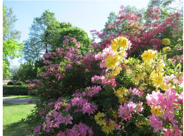
Azaleas in Fuksinpuisto Park, Kotka, Finland