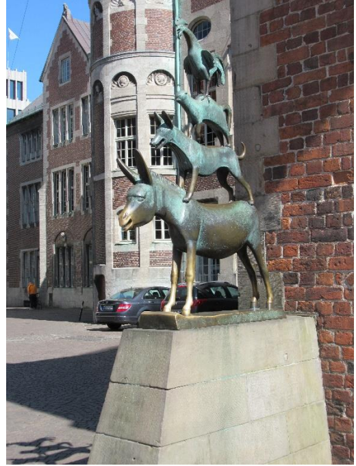
Statue of Grimm Brother's Bremen Town Musicians