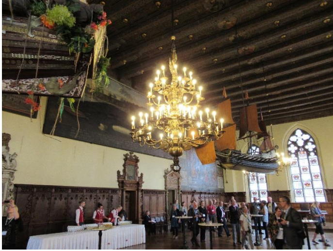
Reception in Bremen City Hall