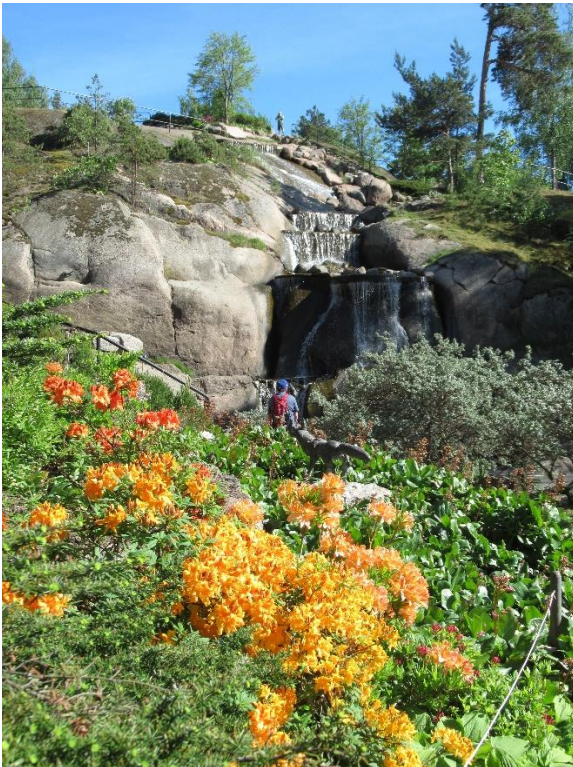
Sappoka Water Park, Kotka, Finland