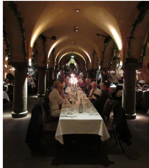
Banquet in the Ratskeller of Bremen City Hall