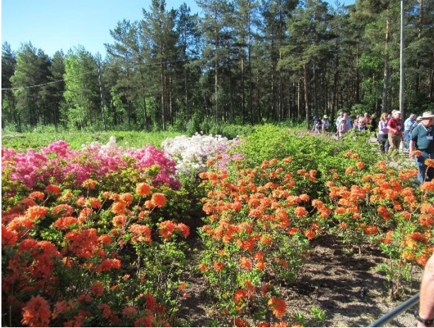
Azaleas in Haaga Rhododendron Garden, Helsinki, Finland