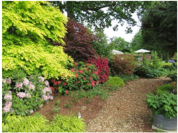
zu Jeddelloh Display Garden