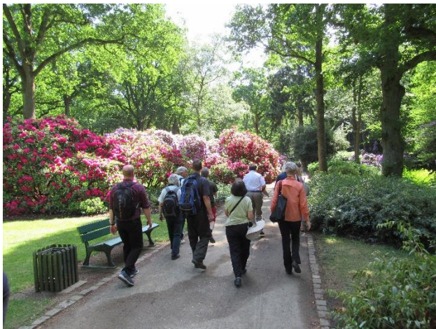
Bremen Rhododendron Garden