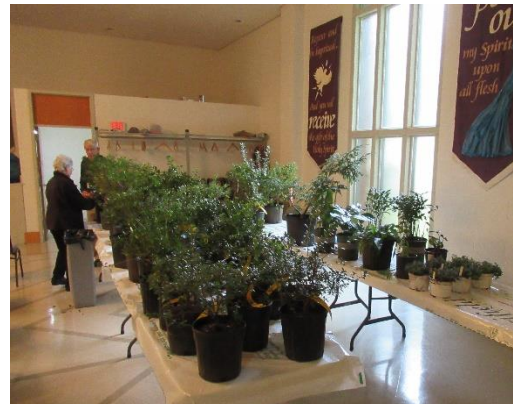
Large selection of azaleas and other plants in the plant exchange

After the presentation there was a drawing. Four lucky winners took home copies of the azalea 'Maybeth', a Bowie Mill hybrid. There was also a plant exchange with a large number of beautiful, mature azalea plants as well as other garden varieties. Many of us went home with some outstanding plants (and now the additional work of planting them)!