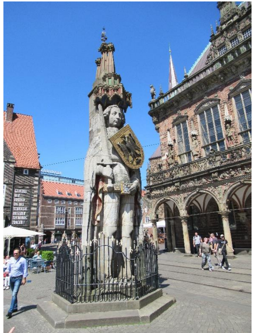
Roland Statue in front of the Bremen City Hall