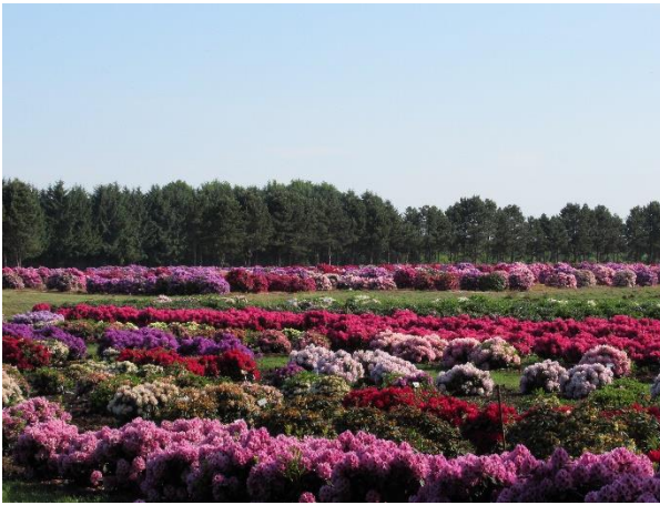
Van den Berk Rhododendron Nursery