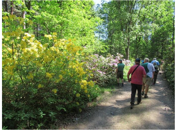
Mustila Arboretum, Finland