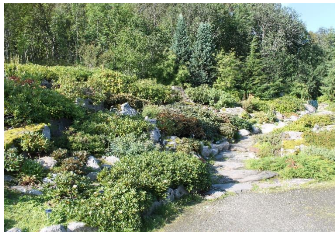
Alpine-Arctic Botanic Garden, Tromsø, Norway -northernmost botanic garden – 240 miles north of the Arctic Circle!