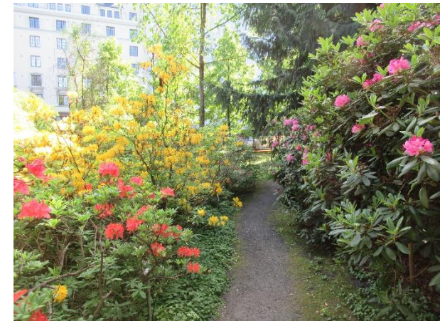
Azaleas and Rhododendron in Helsinki Arboretum