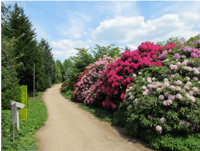
Pathway through rhododendrons in Park of the Gardens