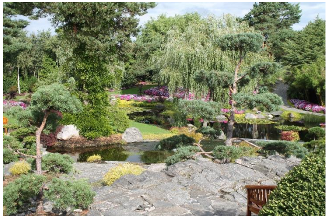
Flor og Fjære, Stavanger, Norway – northernmost tropical garden in the world