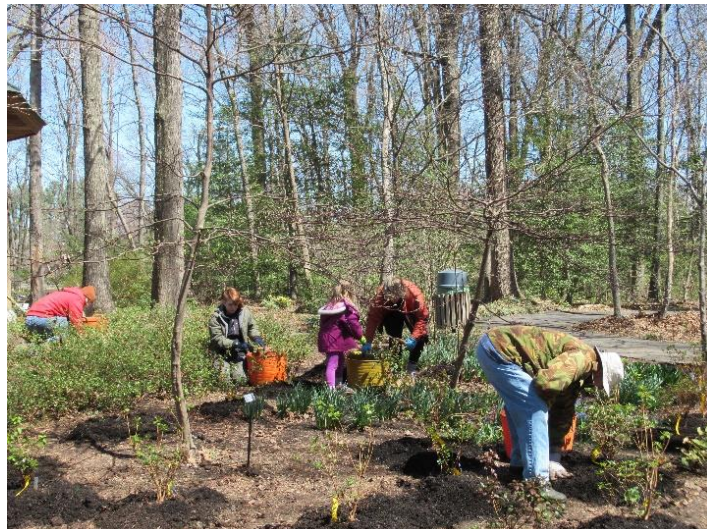
Chapter volunteers plant azaleas in the Klimavicz Garden