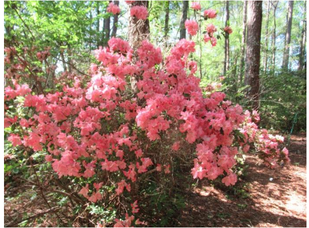
Hampton Beauty (Pericat)