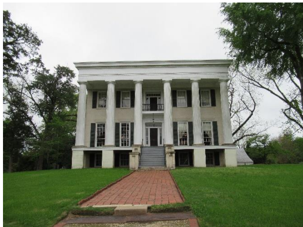
Rose Hill Mansion at Lockerly Arboretum