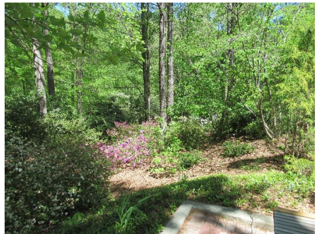
View of Georgia Botanical Garden