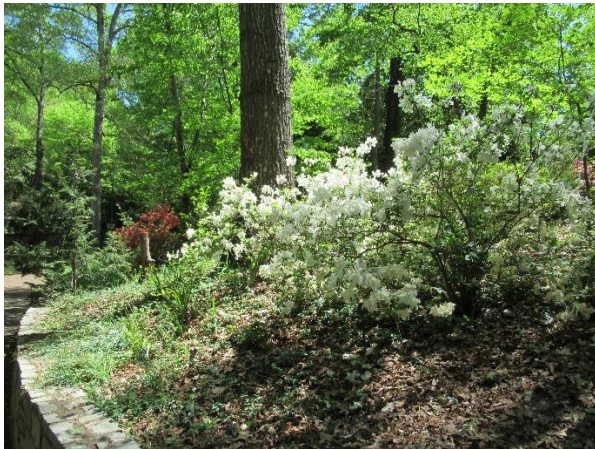
Georgia Giant (Harris)