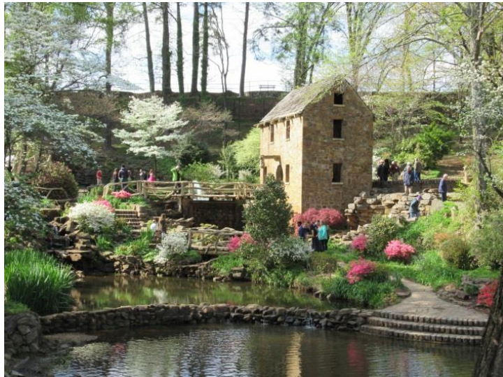
Old Mill in North Little Rock

After leaving the Coleman Garden , we headed to North Little Rock to the Old Mill. This building was seen in the opening scenes of "Gone with the Wind" and is thought to be the only remaining structure from the film. The site includes a large number of concrete structures and a bridge created by sculptor Dionico Rodriguez . By this point the weather had turned beautiful, as were the azaleas on the property.