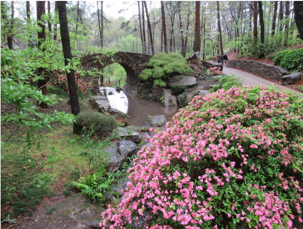
Left – Stone Bridge in Garvan Gardens