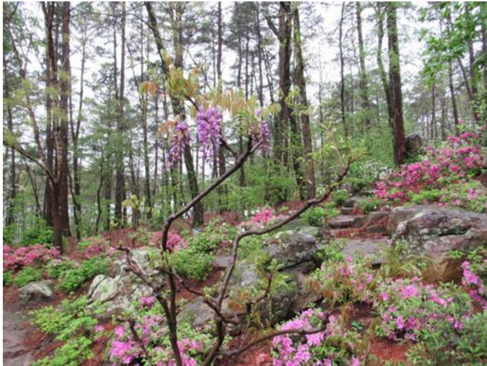
Azaleas and other plants in bloom at Garvan Gardens

Our next stop was a visit to Garvan Gardens in Hot Springs, AR. The 210 acre botanical garden is part of the University of Arkansas and was established for education, research and public service. We were able to catch the tail end of their tulip season. Again, the azaleas were in fine form with a large number of Encore® azaleas as well as many other varieties including natives.