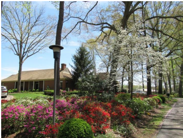
Cosby Garden - Rockville, VA (above and bottom right)