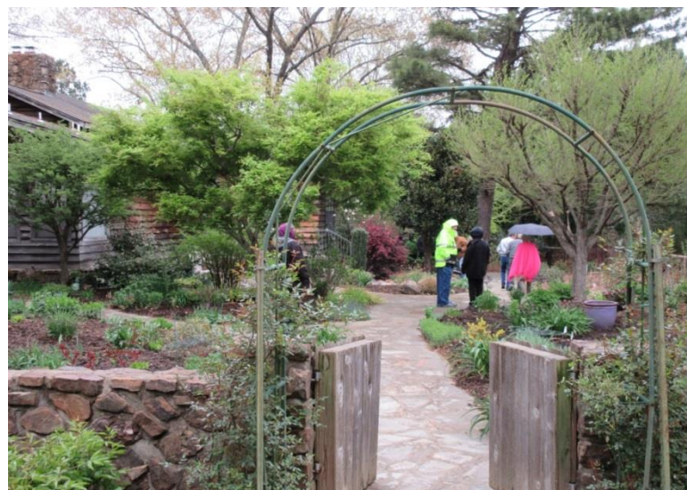
Entrance to Wood Garden