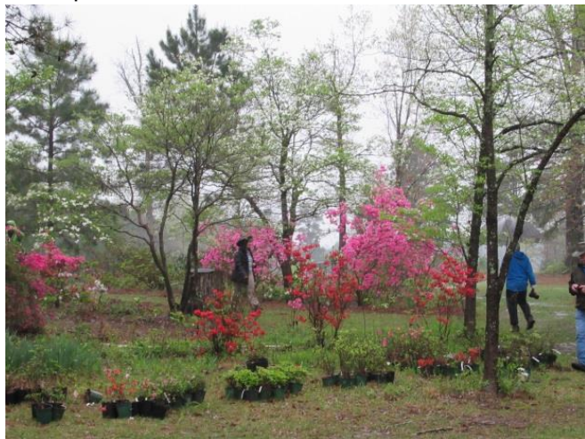
Azaleas in bloom at Azalea Hill Garden and Nursery