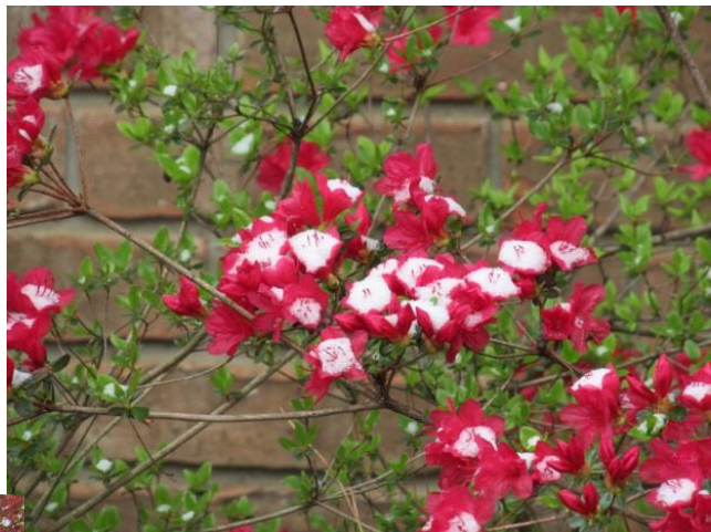
“Snow Kissed” Azaleas at the Coleman Garden

On Saturday we headed north east of Little Rock to Ann Woods’ garden in Searcy, Arkansas. It was snowing lightly as we walked up the Woods’ long driveway. They have a beautiful garden, but I think the highlight was the wonderful wood stove they had going full blast in their barn.