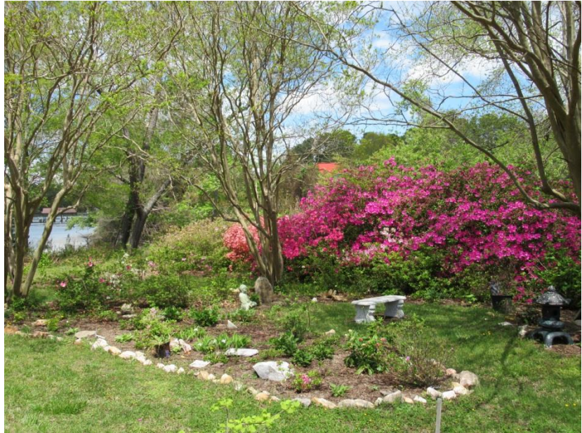
Formosa and other azaleas in the Bauer Garden