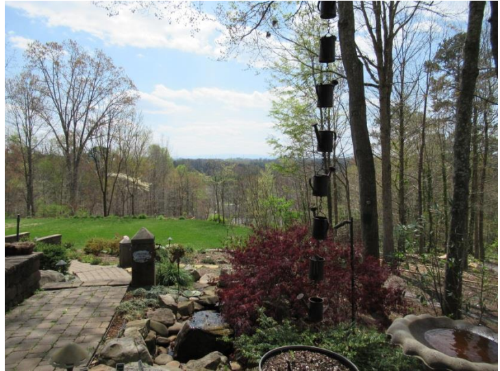
View of the Smoky Mountains from the Anderson Garden, Knoxville, TN