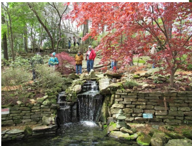
Water Feature in Coleman Garden

After the Woods’ garden we headed to Batesville, AR to the garden of society member Larry Coleman . We had lunch in Batesville’s new community center. This modern 100,000 square foot facility includes a gym and aquatics center. It