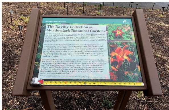
Sample main display sign

The next step is to procure signage for the garden. The main sign for the garden will look similar to the one they currently have for the daylily collection. Our sign will include a brief description of the Klimavicz hybrids and the Legacy Project . It will also note the support provided by the Northern Virginia Chapter in developing the garden. Finally, the sign will have a QR code which will take the user to the