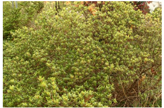
Saotome R. indicum