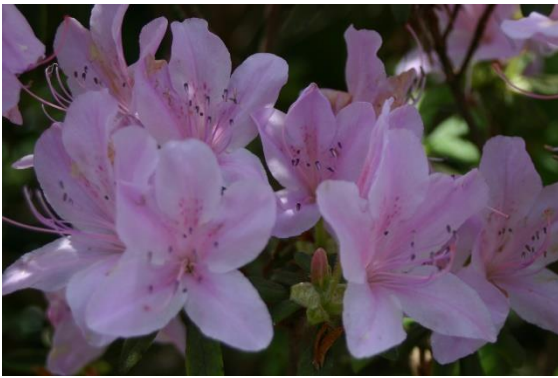
R ripense Makinoi species selection