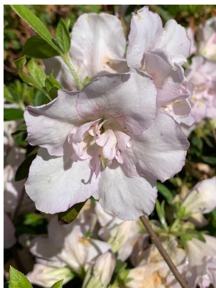
Pink Ice (Belgian Glenn Dale)