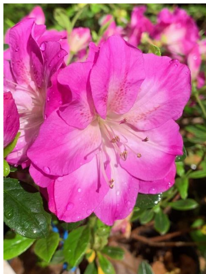
Marshy Point Lavender Miss