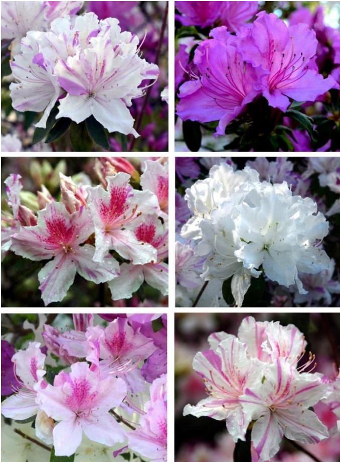
'Quakeress' Flower Variations