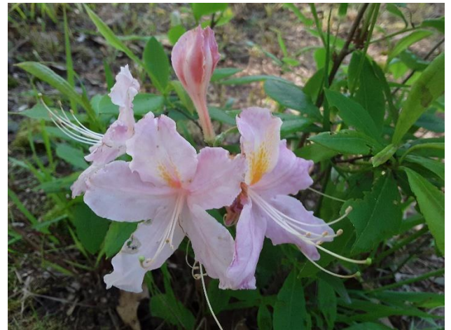
Tri-lights (Northern Lights) – purchased in 2011 at the Evansville ASA convention. Normally zone 3-7. We're zone 8. First time it bloomed this year.