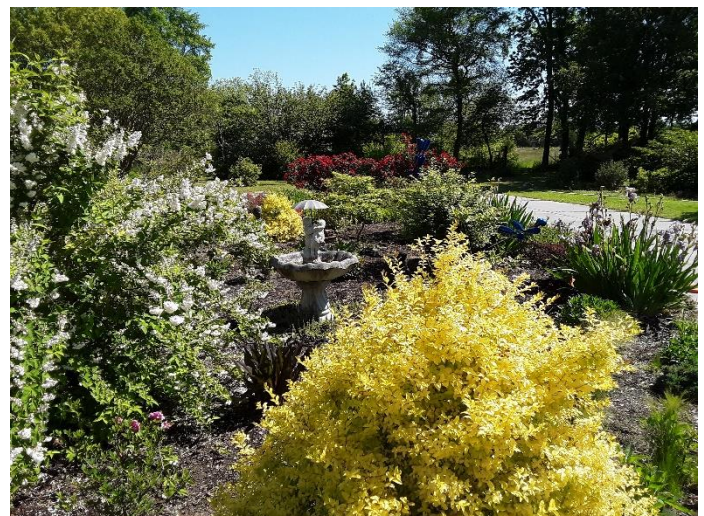
Eclectic Collection of Plants