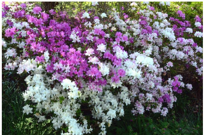
'Quakeress' in the Hyatt Garden

Jane had an enormous 'Quakeress' planted in the center of a driveway loop at the front of her house. It was spectacular. It must have been 12 ft tall and just captivating. Looking at all the flowers variations, they seemed like snowflakes where no two are alike. I planted three 'Quakeress' azaleas at my street edge as a tribute Jane. They have now become a mass about 10 ft wide and 4 to 5 ft tall. We miss you, Jane!