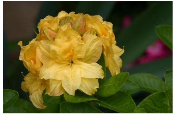
Chetco x Yellow Pompom (Schild)