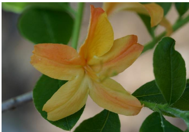
Roan Big Bird - OP