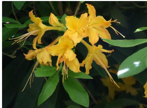
Hooper Bald azalea