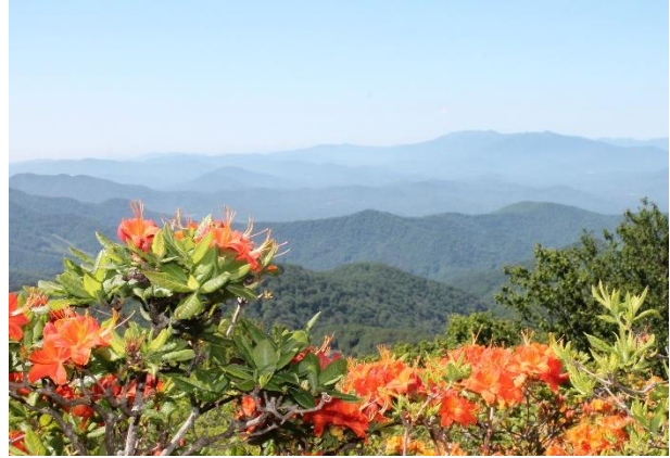
R. calendulaceum on Roan Mountain