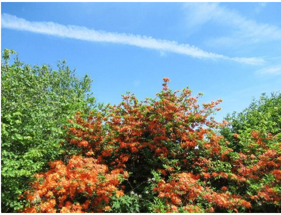
R. calendulaceum on Hooper Bald