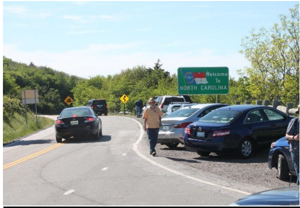
Parking for Roan Mountain on North Carolina/Tennessee border