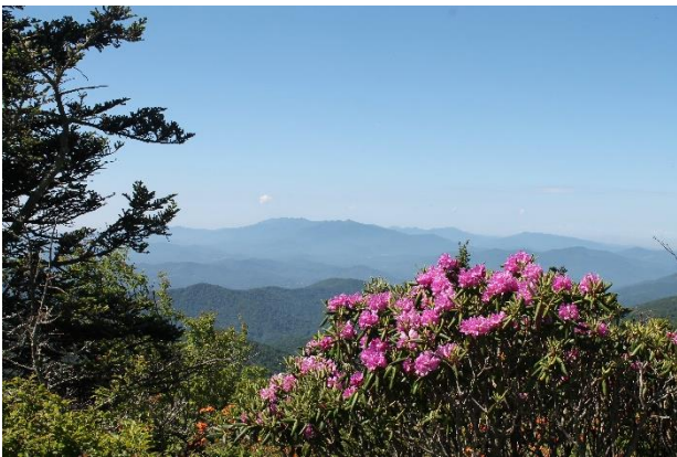
R. catawbiense on Roan Mountain