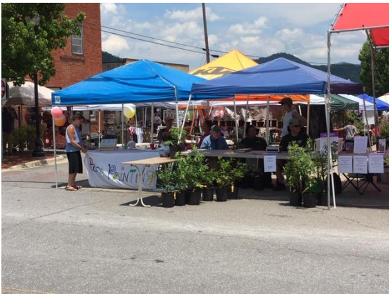
Azalea Society booth at Graham County Azalea Festival