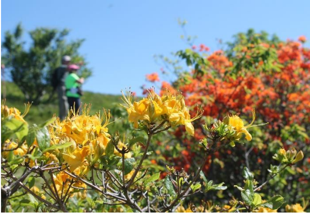
R. calendulaceum on Roan Mountain

Below are some photos from previous Smoky Mountain hikes. I would encourage you to consider participating in future hikes. They normally run over a ten-day period and you are welcome to participate in any part (or all) of the itinerary.