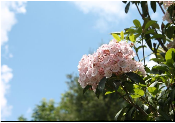
Mountain Laurel on Elk Knob, NC