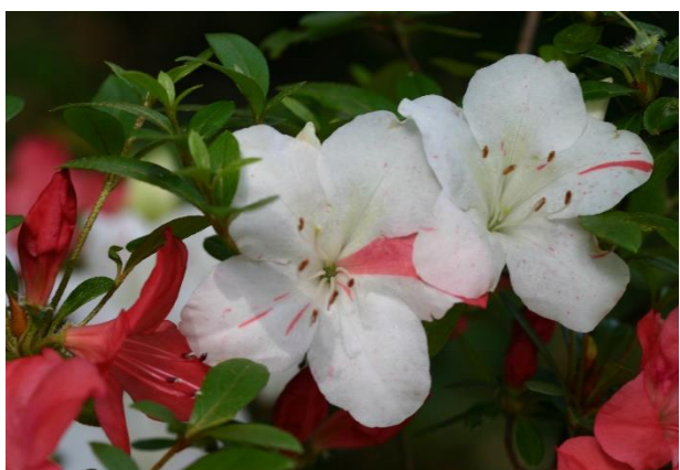
Patches - Satsuki