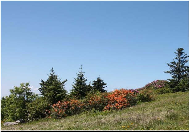
R. calendulaceum on Roan Mountain