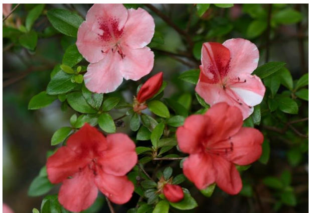
Chiyo-no-Homare - Satsuki

Thanks to all members who have sent in photos from their gardens. Please continue to do so and I will put them in the monthly message. Below are a few photos taken by Carolyn Beck of azalea varieties in the Beck garden.