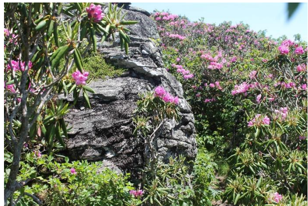
R. catawbiense growing out of rock