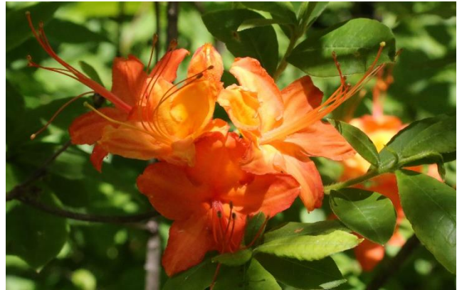
R. calendulaceum on Hooper Bald