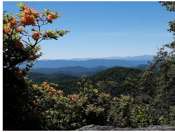
View from Hooper Bald