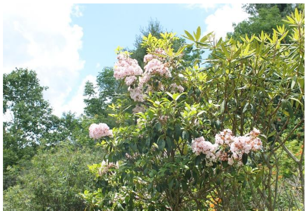
Mountain Laurel on Elk Knob, NC