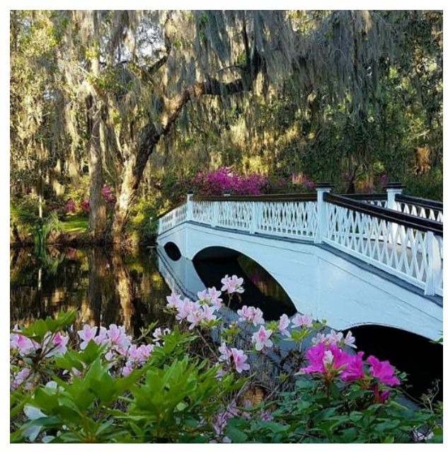
Magnolia Plantation

The fall issue of The Azalean has an article detailing the gardens and the speakers to be featured at the convention. Registration is already underway. You can register by using the form in the Fall Azalean or by going to the ASA website and clicking on About the Society>Conventions. This will give you more information on the convention as well as the registration form. If you've been to a convention before, you know they are a great time. If not, I encourage you to attend the next convention in Summerville. I'm hoping to see a good turnout by chapter members at the convention.