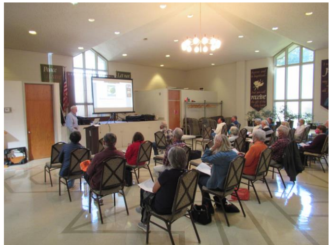
Chapter members listen to the presentation