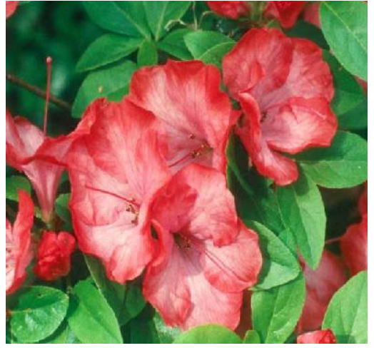
A85-11-1-MargaretDouglasxHotShot-01-800 (McDonald Hybrid)