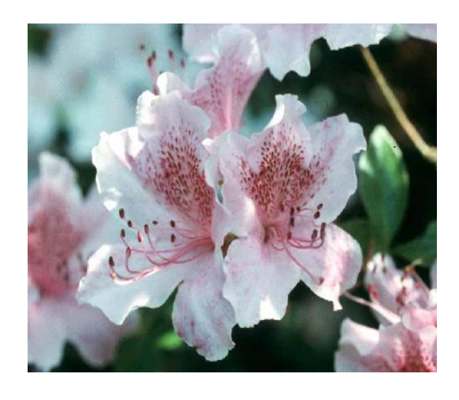
Sweet Freckles, (McDonald hybrid)