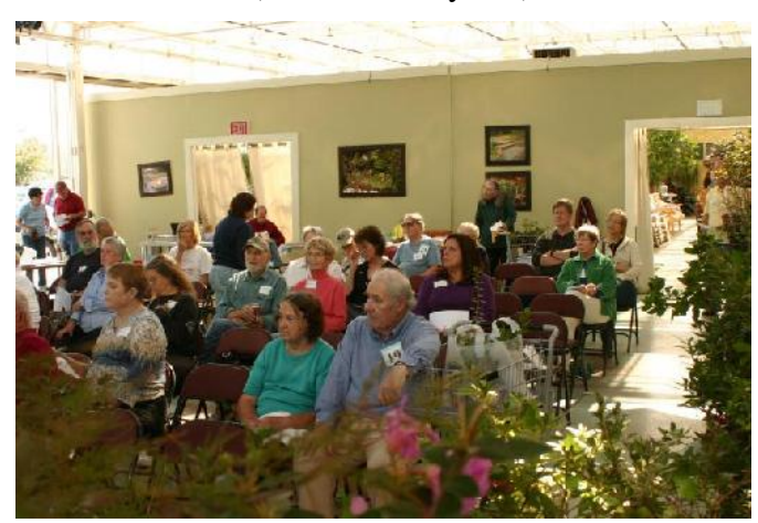
Auction attendees listen to instructions