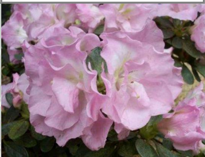
One of the most popular McDonald hybrids is the very large flowered Venus Baby.