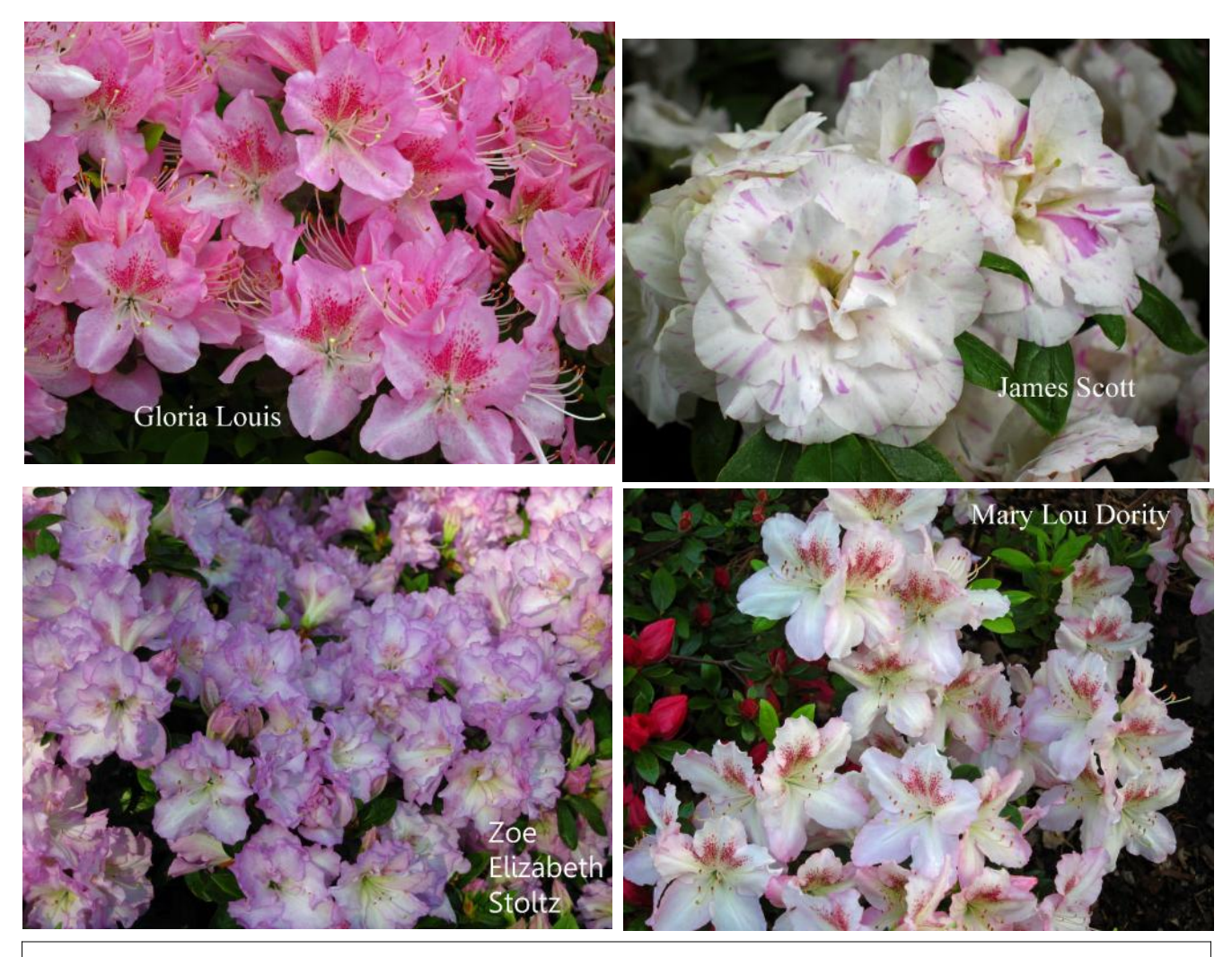
Some of the Klimavicz hybrids that will be available at the auction.