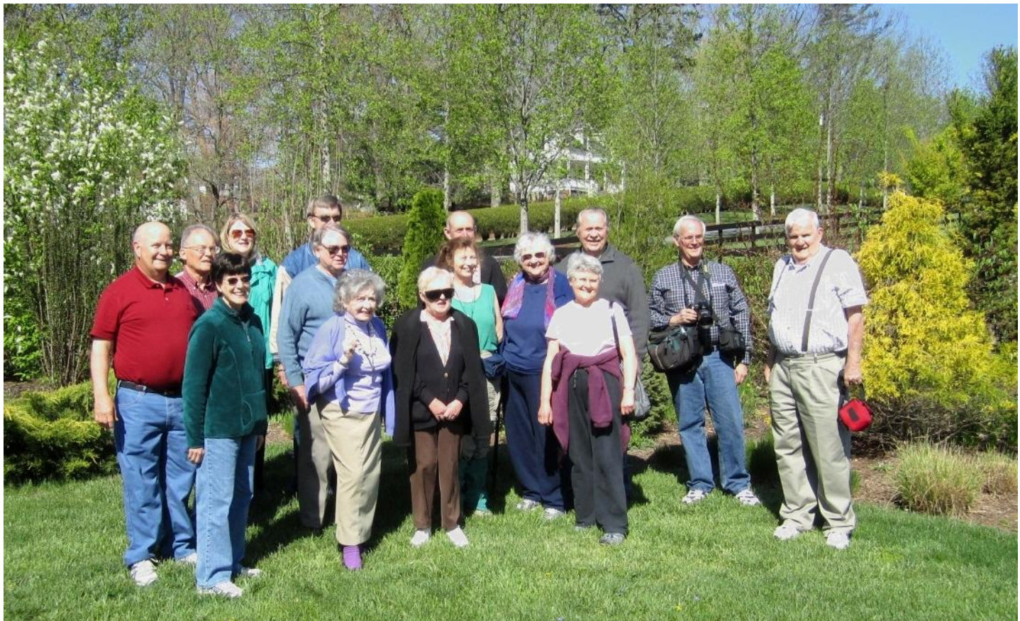
Top Left: Azalea Path, ASA Convention Top Right: Greenspring Plant Sale Bottom: Charlottesville

Check out my Picasa page of club photos from the past, 51 pictures updated through 2006: https://picasaweb.google.com/bsperlin/AzaleaMeetings2001