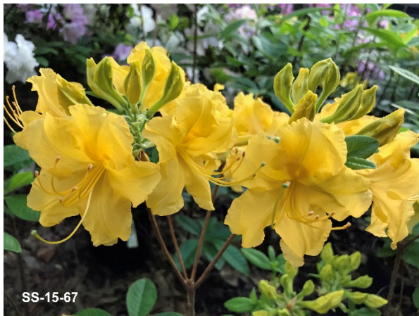
SS-15-67 (Sunnyside Up x Golden Solitaire)