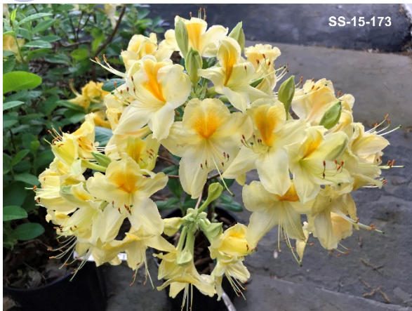
SS-15-173 (Sunnyside Up x Golden Solitaire)