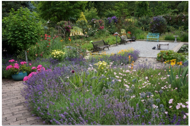
Lavender in Front Yard