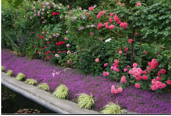
Thyme and Roses