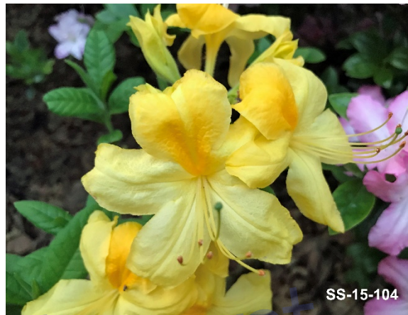
SS-15-104 (Sunnyside Up x Golden Solitaire)