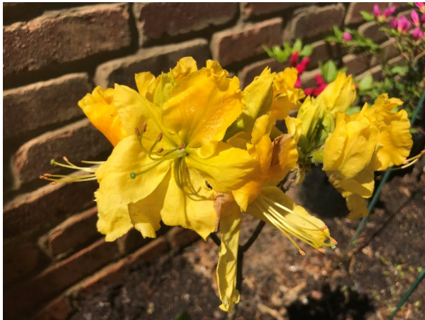
CO-15-7 (Chetco Open Pollinated 2015)

Here are pictures of some of Joe's latest crosses.