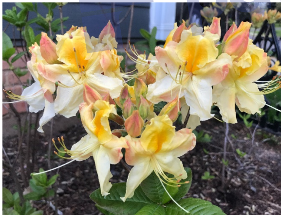
SS15-137 (Sunnyside Up x Golden Solitaire)