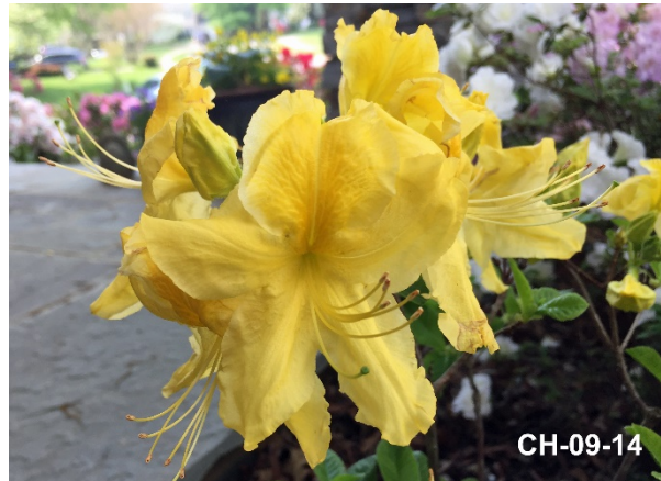
CH-9-14 (Chetco Open Pollinated 2009)