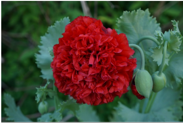
Double Red Poppy