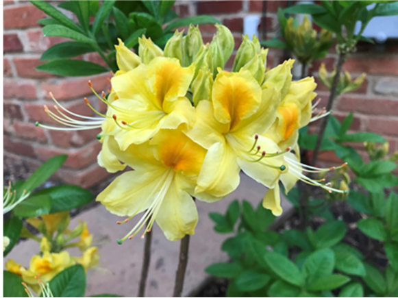
SS-15-176 (Sunnyside Up x Golden Solitaire)