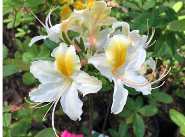
SS-15-182 (Sunnyside Up x Golden Solitaire)