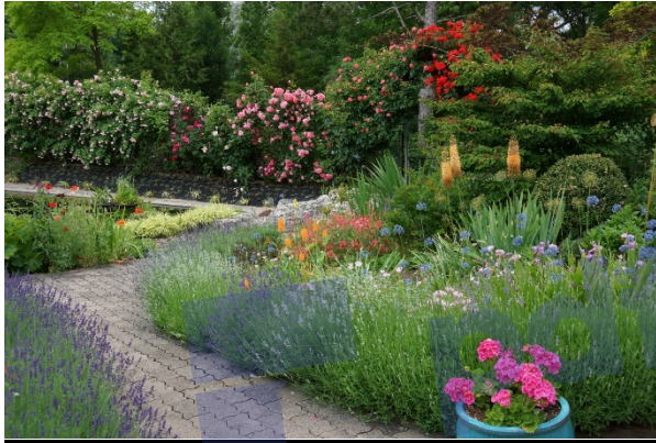
Wall of Roses