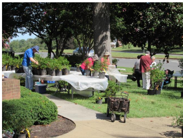
Chapter members set up the sale