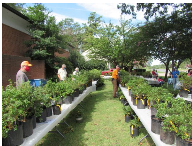
Customers shop for plants