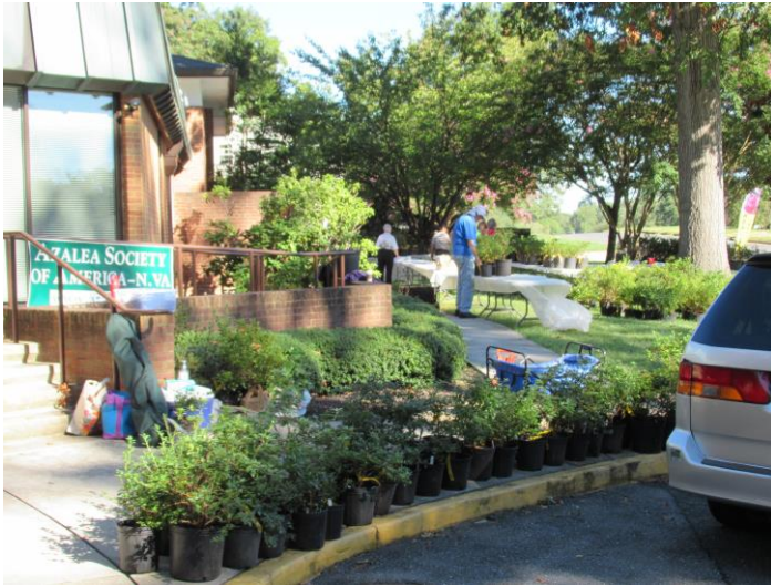
Holly Springs azaleas ready for alphabetizing and placement for the sale