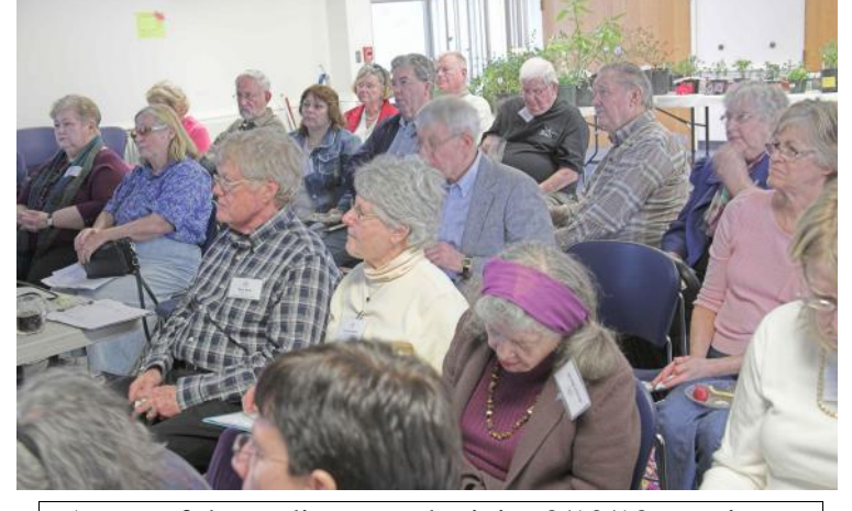
A part of the audience at the joint 3/10/13 meeting. Below: Green Spring sale, photos by Carolyn Beck