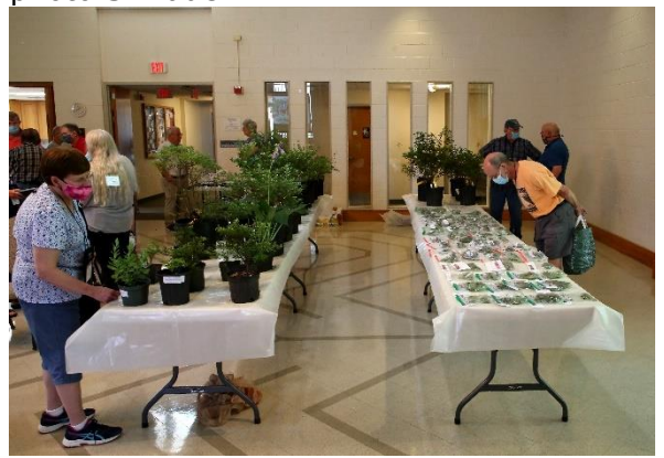
Some of the large selection of azaleas and cuttings available in the plant exchange