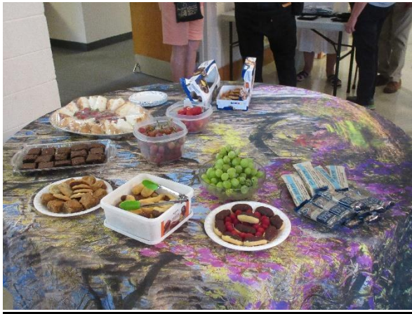
As usual, we didn't go hungry