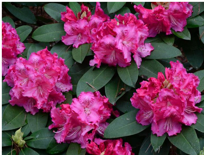
Greer hybrid 'Very Berry'