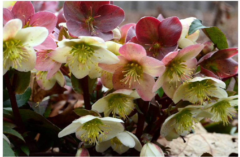
Left: Prunus Mume 'Kobai' Right: Hellebore 'Silvermoon'