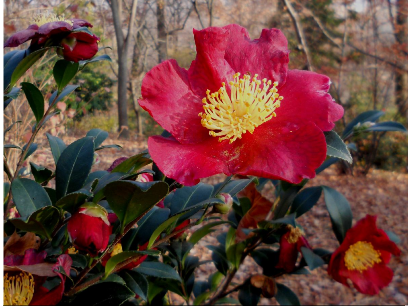
Camellia Sasanqua 'Yuletide'