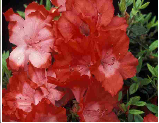
Pam's Passion

NEXT CHAPTER MEETING: SATURDAY SEPTEMBER 28 1:00 - 4:30