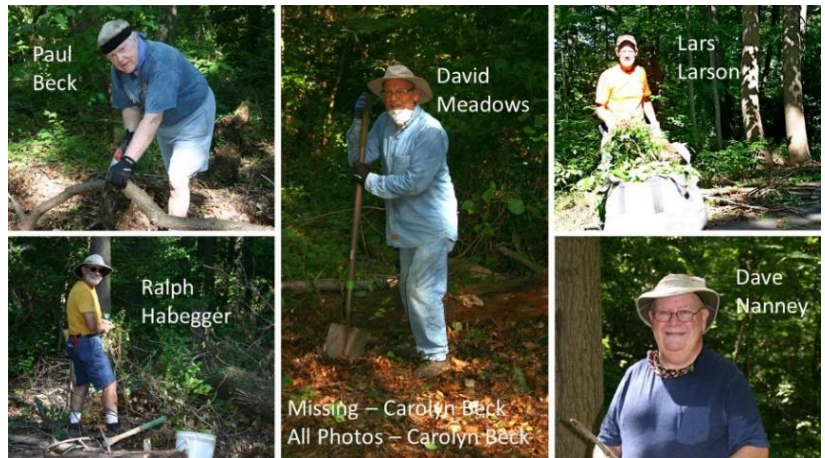
Klimavicz Garden workday

The chapter has planted a Klimavicz Legacy Garden at Meadowlark Gardens and has plans for a future Bob Stewart Legacy Garden at the same site. The chapter entered into a Memorandum of Agreement with Meadowlark Gardens when developing the Klimavicz Legacy Garden where we agreed to provide a monthly level of maintenance for the garden. We are grateful to the chapter members who have participated in these workdays over the past year and we encourage other chapter members to join us in the future.