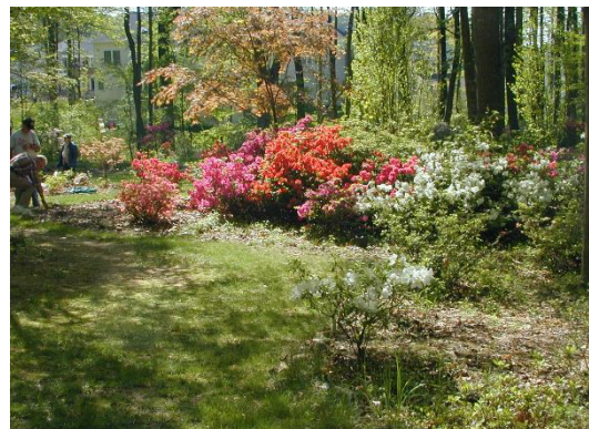
Nanney Garden - photo unknown

Dave and Leslie Nanney have opened their garden for an extended period during the season. They have approximately 2,500 azaleas with 1,000+ varieties on 2 ½ acres of wooded gardens. Paths throughout make for easy access to all parts of the garden.