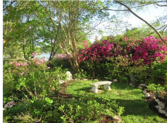
Bauer Garden

Contact is rickbauer@cox.net or (757) 771-4446.