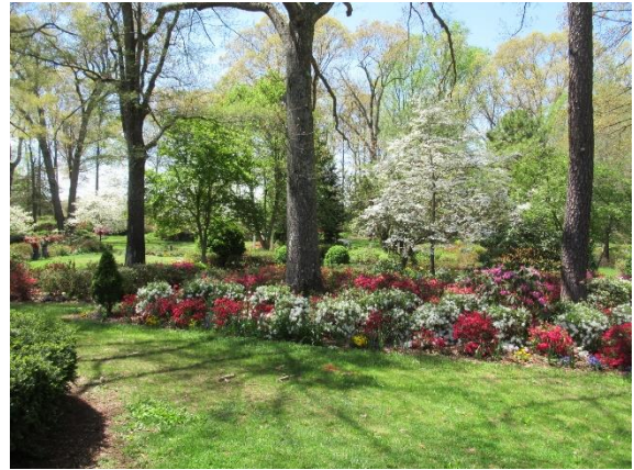
Cosby Garden

Roy and Elizabeth Cosby have opened their garden to a chapter visit on 20 April. Their 79 acre property includes 11+ acres of azaleas and rhododendron. In the past few years they have planted a number of beds of Legacy varieties and have also expanded their collection of deciduous azaleas.