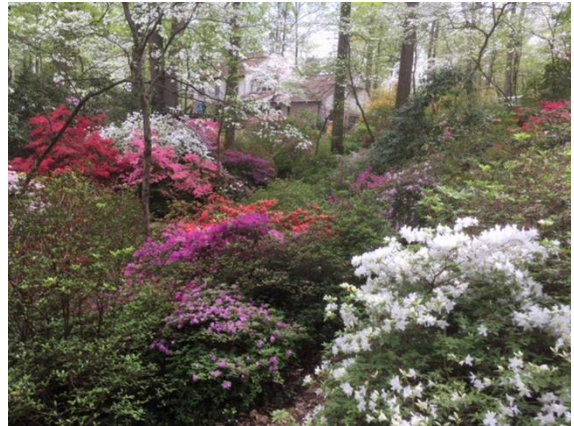
McWhorter Garden

Address is 1666 Preakness Dr., Gambrills, MD 21054. They are looking forward to sharing the garden with others. It should be beautiful this year!