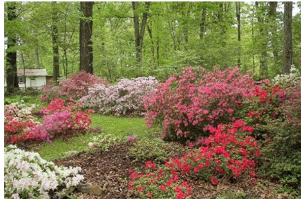
Sperling Garden

The garden location is 7732 Schelhorn Rd., Alexandria, VA 22306